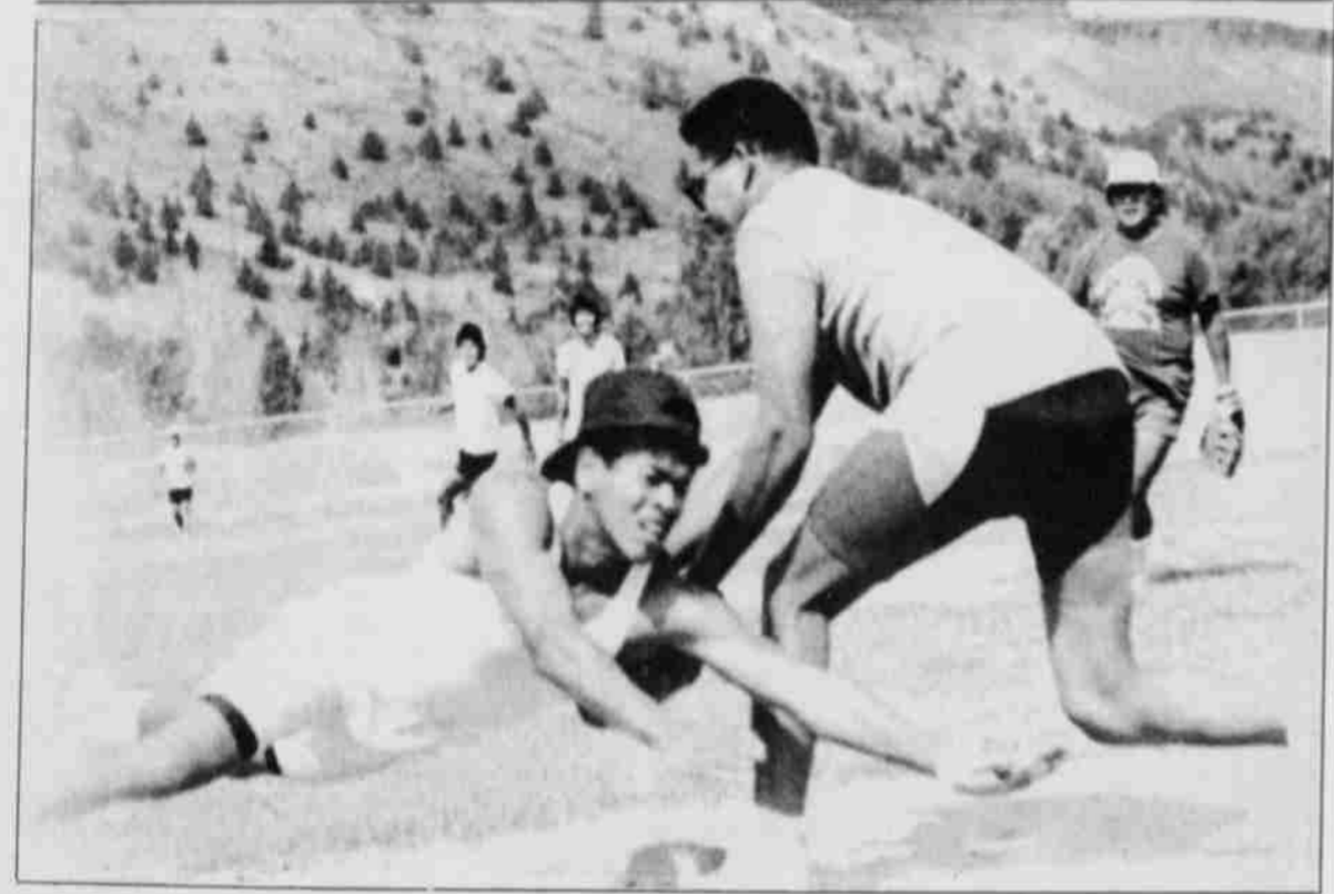
The action was hot and heavy during the men's tournament last weekend. The Reservation Suns were victorious in their bid for the championship.

barbecue from 4 to 6 p.m.; Miss Klamath pageant at 7 p.m. and a warm-up powwow starting at 8 p.m. On August 27, a cowboy breakfast will be held at 8 a.m. Church services will begin at 10 a.m. Another barbecue will be held from 4 to 6 p.m. and a competitive powwow will start at 6:30 p.m. Concessions and arts and crafts will also be on hand. Awards for the rodeo events will include for the All-Around Champion a jacket and spurs. All event winners will receive buckles and the special event winners will receive jackets. The Klamath Tribe invites everyone to this annual event.