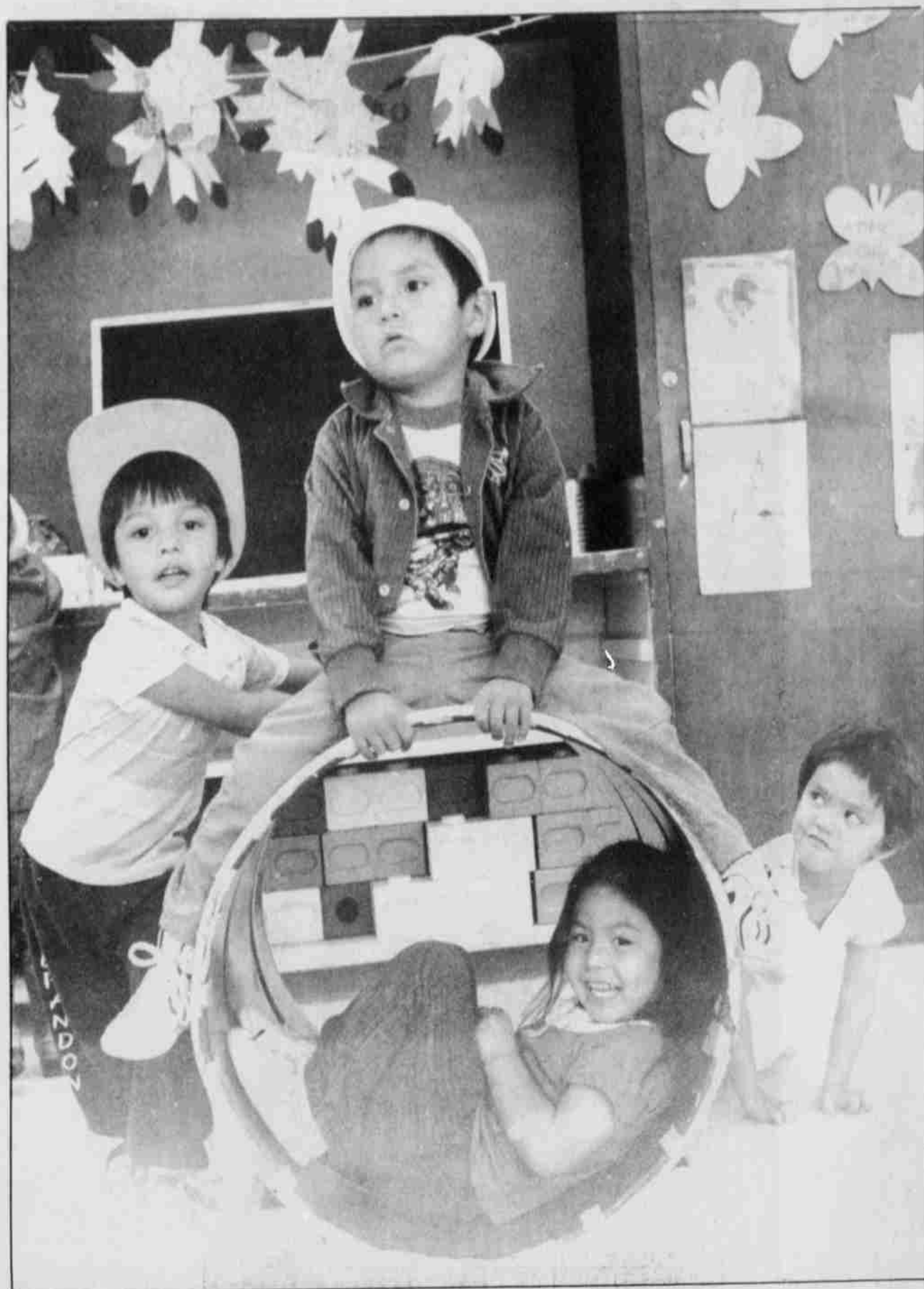
Play time at Head Start usually means friends gathering together. Children learn to cooperate with one another.