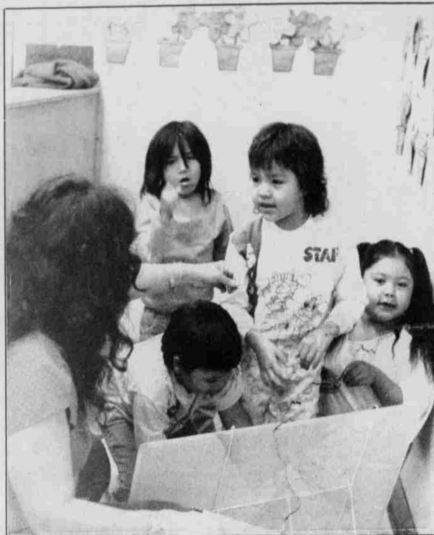
Children are taught Indian language.

Number of Employees — 18 Number of Children — 49 Cost per Child — $4,744 Total Budget — $484,844 Location — Community Center Number of Classrooms — 4