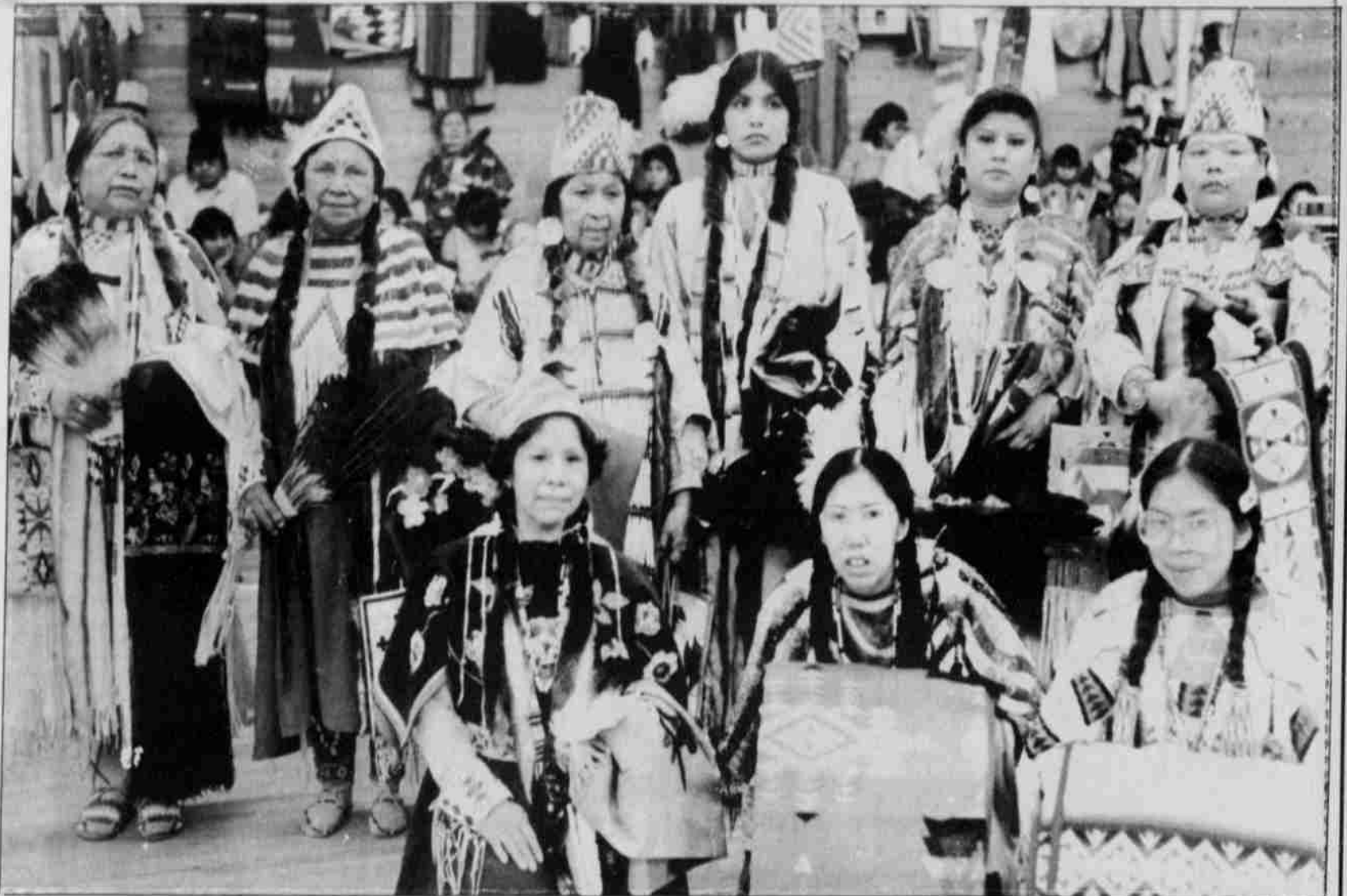
The Isabelle Keo Memorial called for the display of antique dresses. Most dresses had been handed down four or five generations.