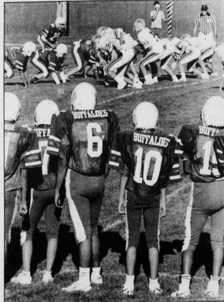
Football season is over for Madras High School freshmen and sophomores. Some JV players will still get a chance to play at the final varsity game November 4 against Ontario. The game begins at 7:30 p.m. at the high school.