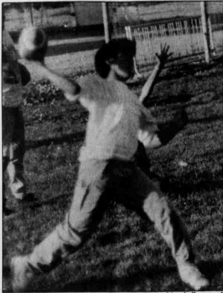
held at the Friday night Madras White Buffaloes final football game of the season. Competition will be held during halftime.