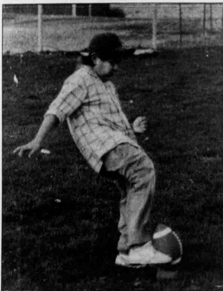
Warm Springs kids participated in the punt, pass and kick contest eliminations at the Community Center for the last two weeks. The top three winners in each of the age groups will compete in the finals to be