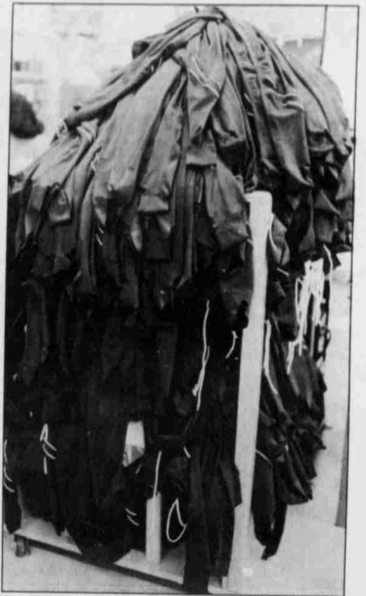
Piped tights are stacked in portable bins before they are hemmed.