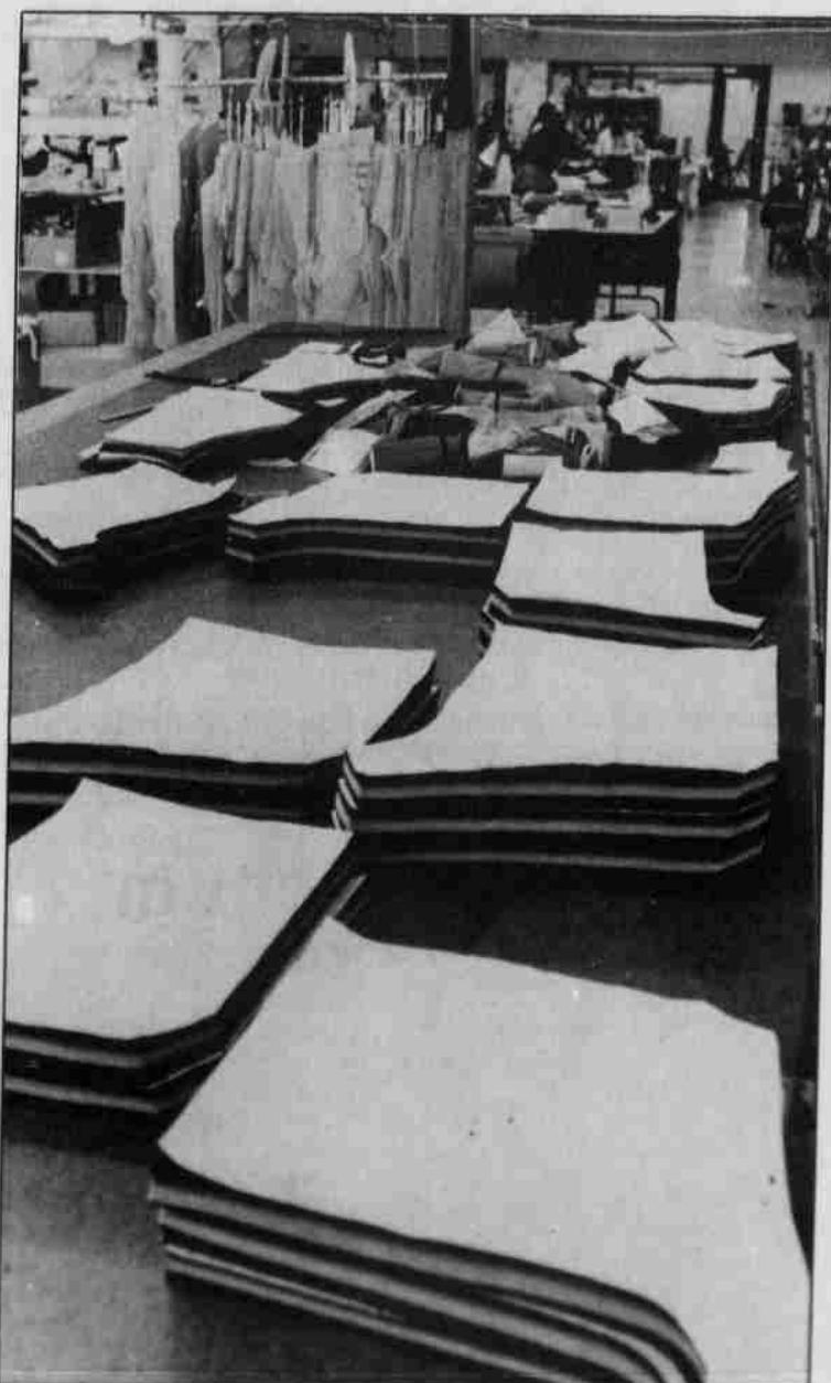
Patterns are mass cut before they are stitched together.

To celebrate their second anniversary, WSAI will have a sale Thursday, October 27 from 11:30 a.m. to 1:30 p.m. at the plant. For sale will be sweatshirts, shorts and many other items, including fabric. A special blessing ceremony and open house is planned for Friday, November 18.