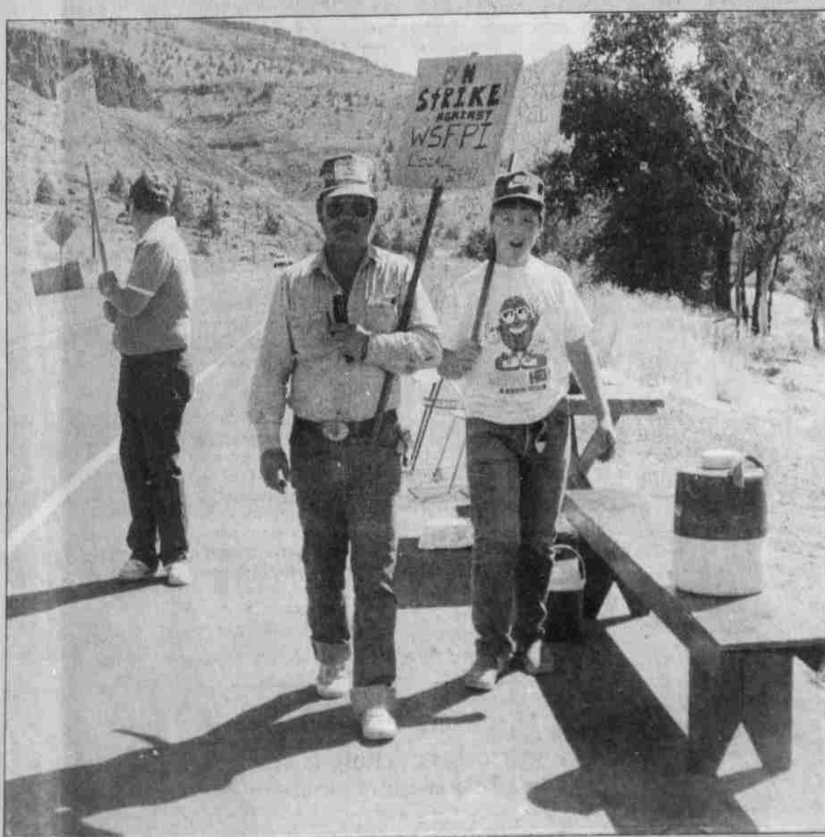
A striker and his son walked the picket line across Highway 26 from the Rainbow last week as the strike entered its fourth week.