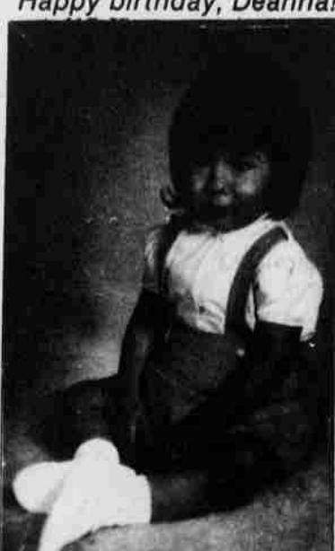
Love. Mom and Family