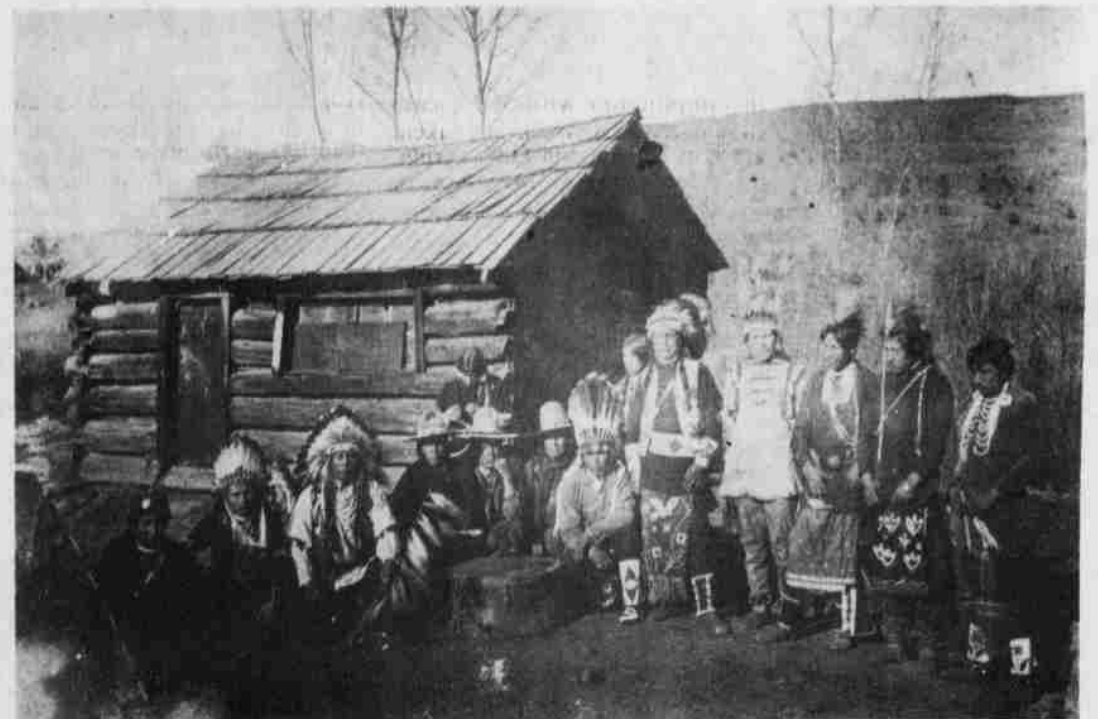
Tribal leaders meet