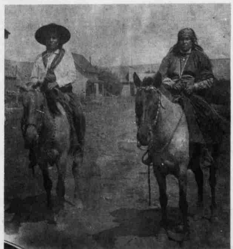
Man and wife