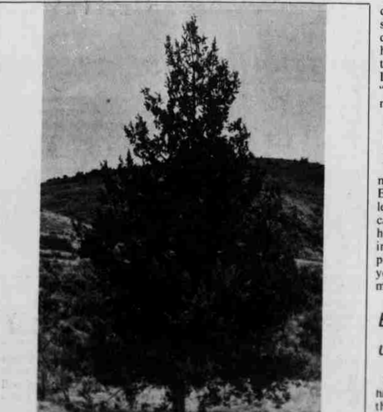
Identify this Geo-quiz and you will win a week's stay at Motel 7 on Portland's famous skid row and dinner for eight at Baloney Joes. P.S.: This tree is destined for the White House lawn for Christmas festivities.