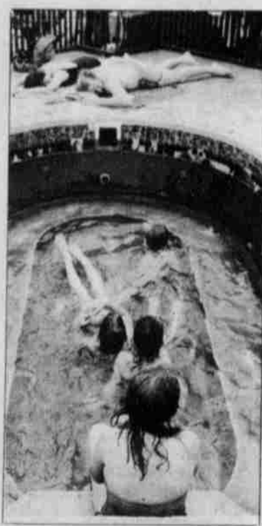
Nude sunbathing will begin at Kah-Nee-Ta very soon. Guests are anxiously awaiting the new experience.

Those people with first, middle or last names beginning or ending with the letter W will not be allowed to use the beaches at all. "There's