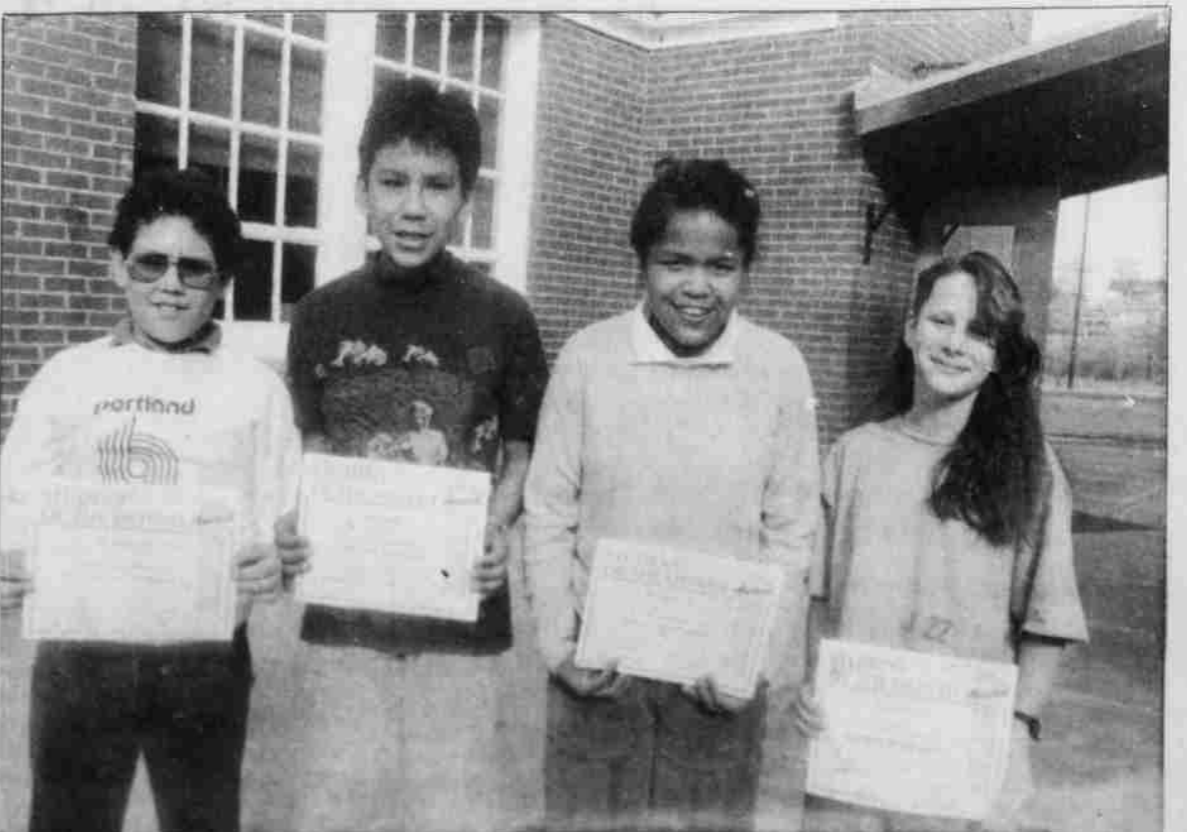
MJH Students of the Month