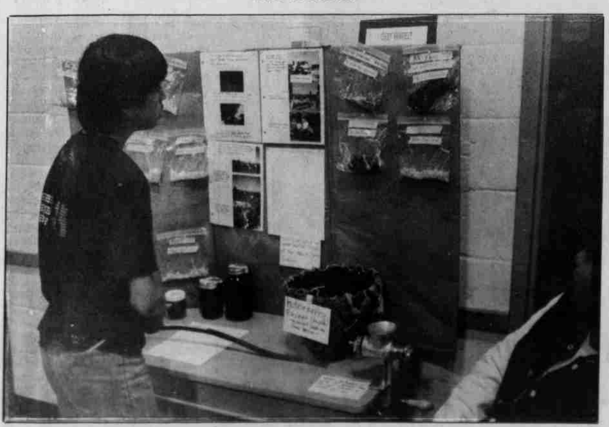
The second annual Cultural Fair at Buff Elementary provided sixth grade students the opportunity to share their family histories with fellow-students and parents.