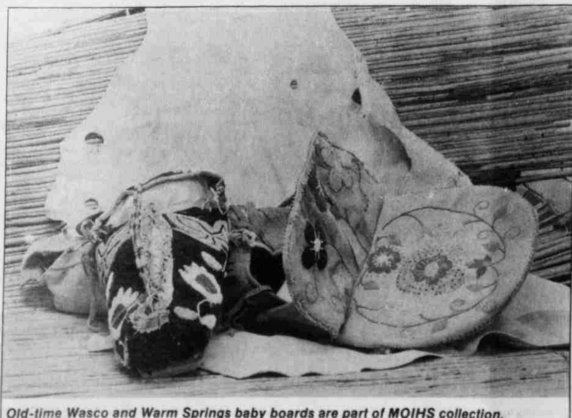
Old-time Wasco and Warm Springs baby boards are part of MOIHS collection.