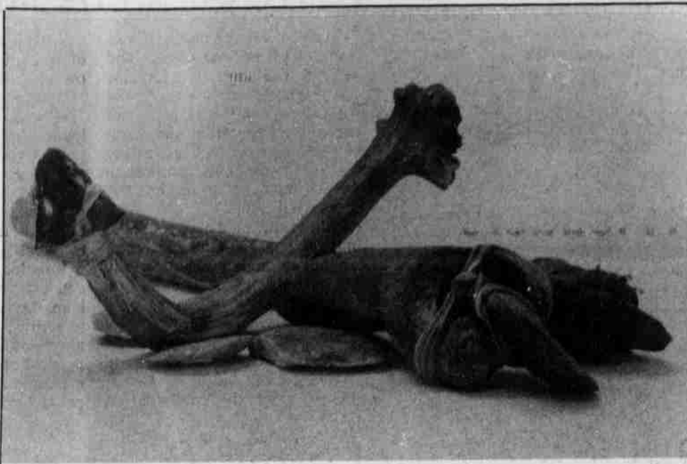
Ancient hide tanning tools were made with bone or antler handles with chipped stone blades.