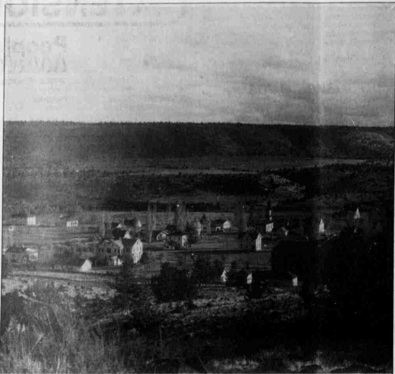
A view of Warm Springs shows that our community has changed.