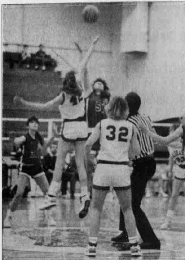
Spilyay Tymoo photo by Miller