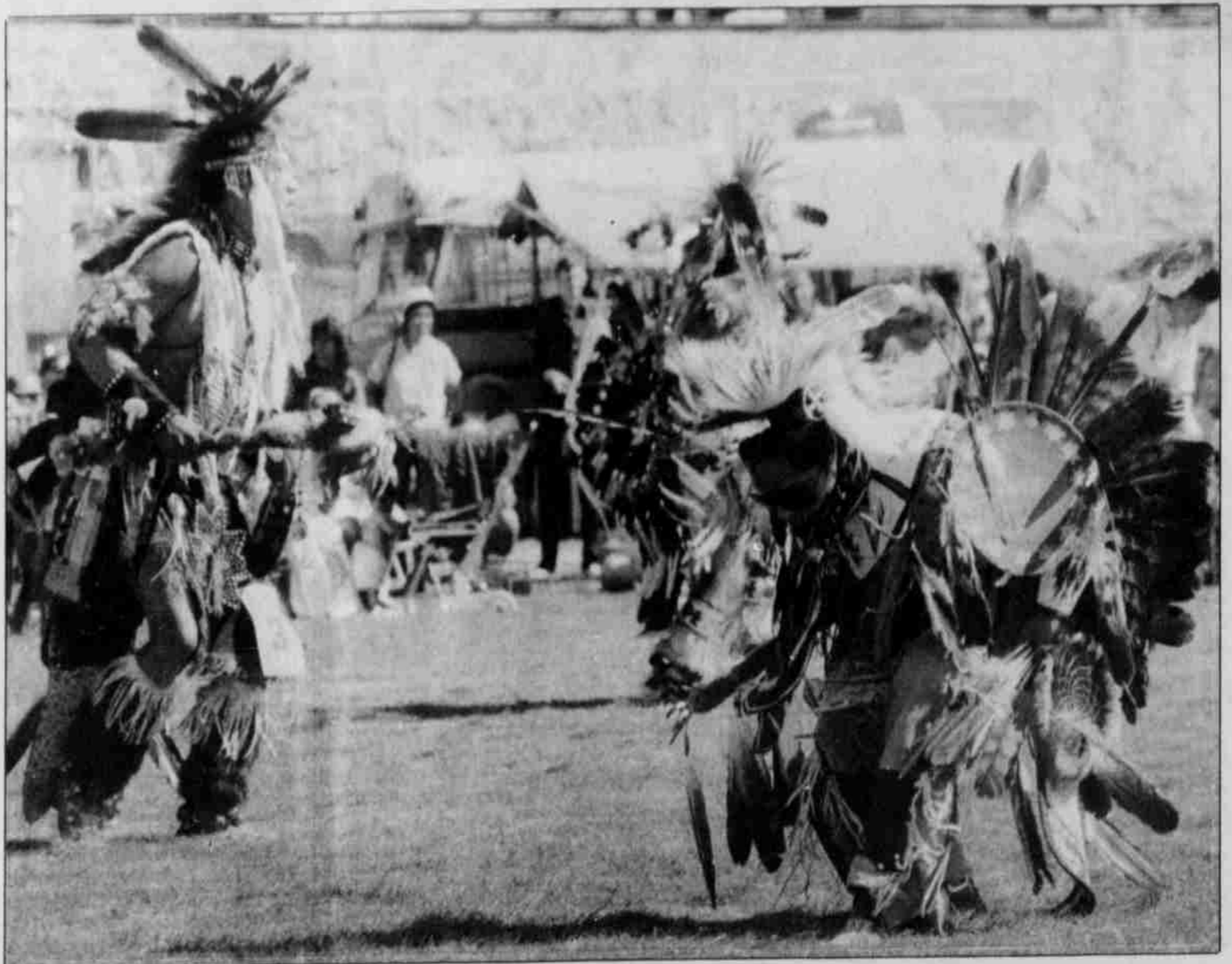
Pi-Ume-Sha drew dancers of all kinds to Warm Springs this year, not unlike past years.