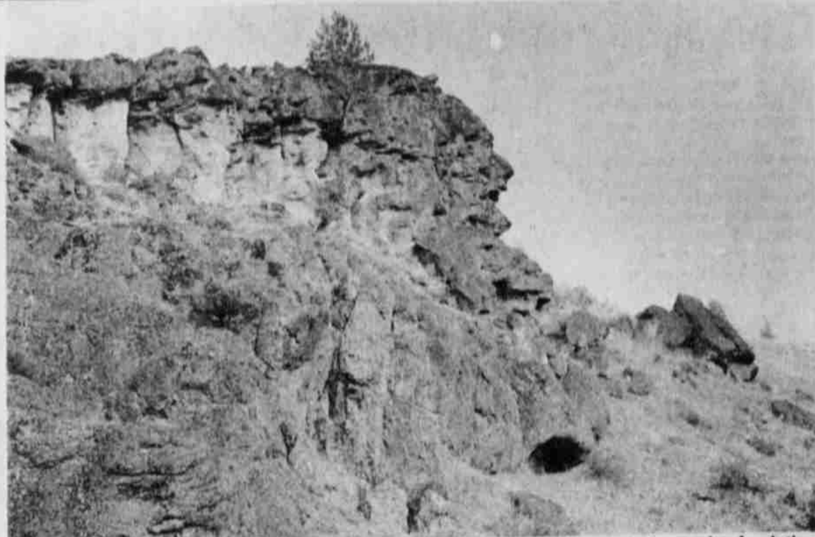
Identify the location of this geologic formation on the Warm Springs Reservation and win a year's subscription for yourself or a friend. For a Christmas bonus from Spilyay the first five callers with the correct answer will win. Call 553-1161, Ext.274 with your answer.