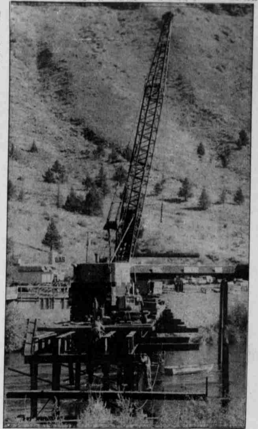
A temporary work bridge built parallel to the Deschutes Bridge is expected to be in place for six to ten months. The $1.5 million job will about the double the driving space of the bridge and is due for completion by next fall.

A general council meeting is scheduled for Thursday, November 12 at the Agency Longhouse to discuss the budget. Dinner will be served at 6 p.m. with the meeting to follow.