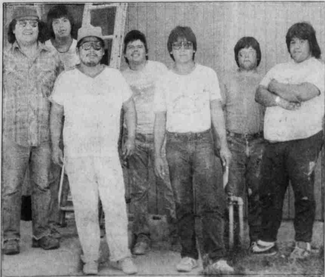
Willamette Apprenticeship Carpenter apprentices