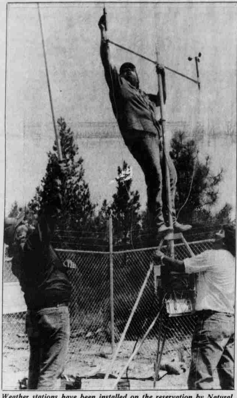
Weather stations have been installed on the reservation by Natural Resources employees.

Weather stations recently installed at five locations on the Warm Springs Reservation will provide information on temperature, humidity, soil moisture, wind speed, wind direction and evaporation rates.