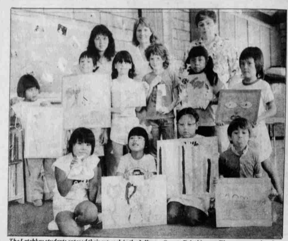
The Latchkey students entered their artwork in the Jefferson County Fair this year. They were proud to show off the ribbons they won for their efforts.