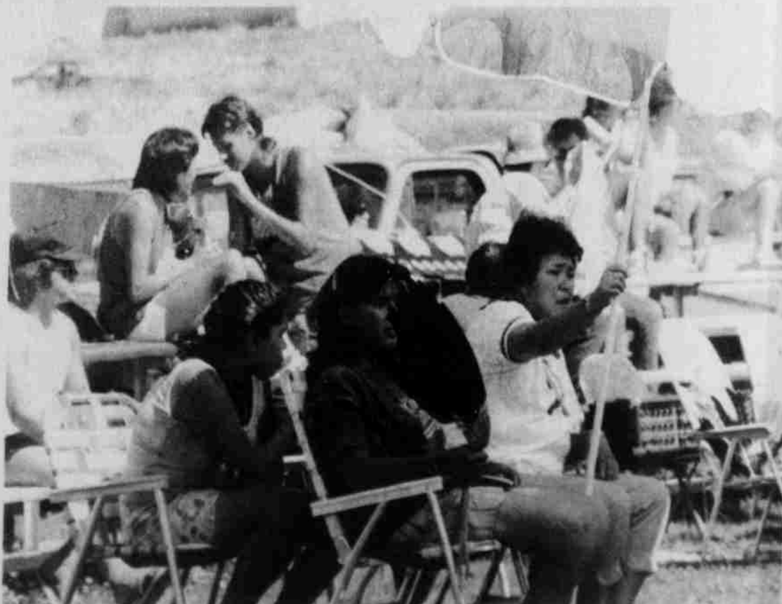
Spectators tried to beat the heat in any way possible, including popping up large umbrellas. Soda sales were brisk during the powwow.