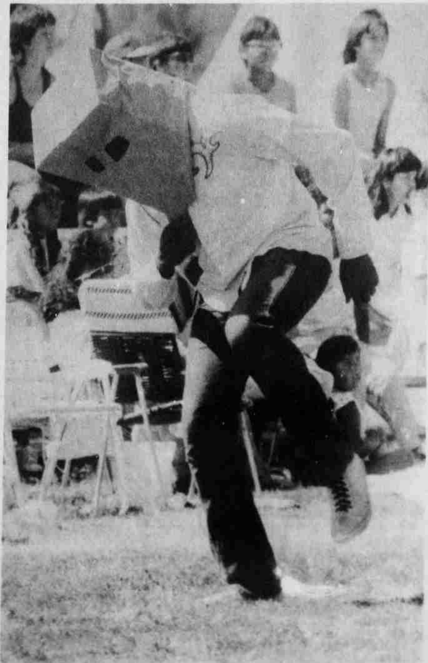
The "Unknown Dancer", complete with paper bag, showed his stuff during a "honky" dance. The dancer had previously been singled out as a non-Indian, but in fact, was an Indian.