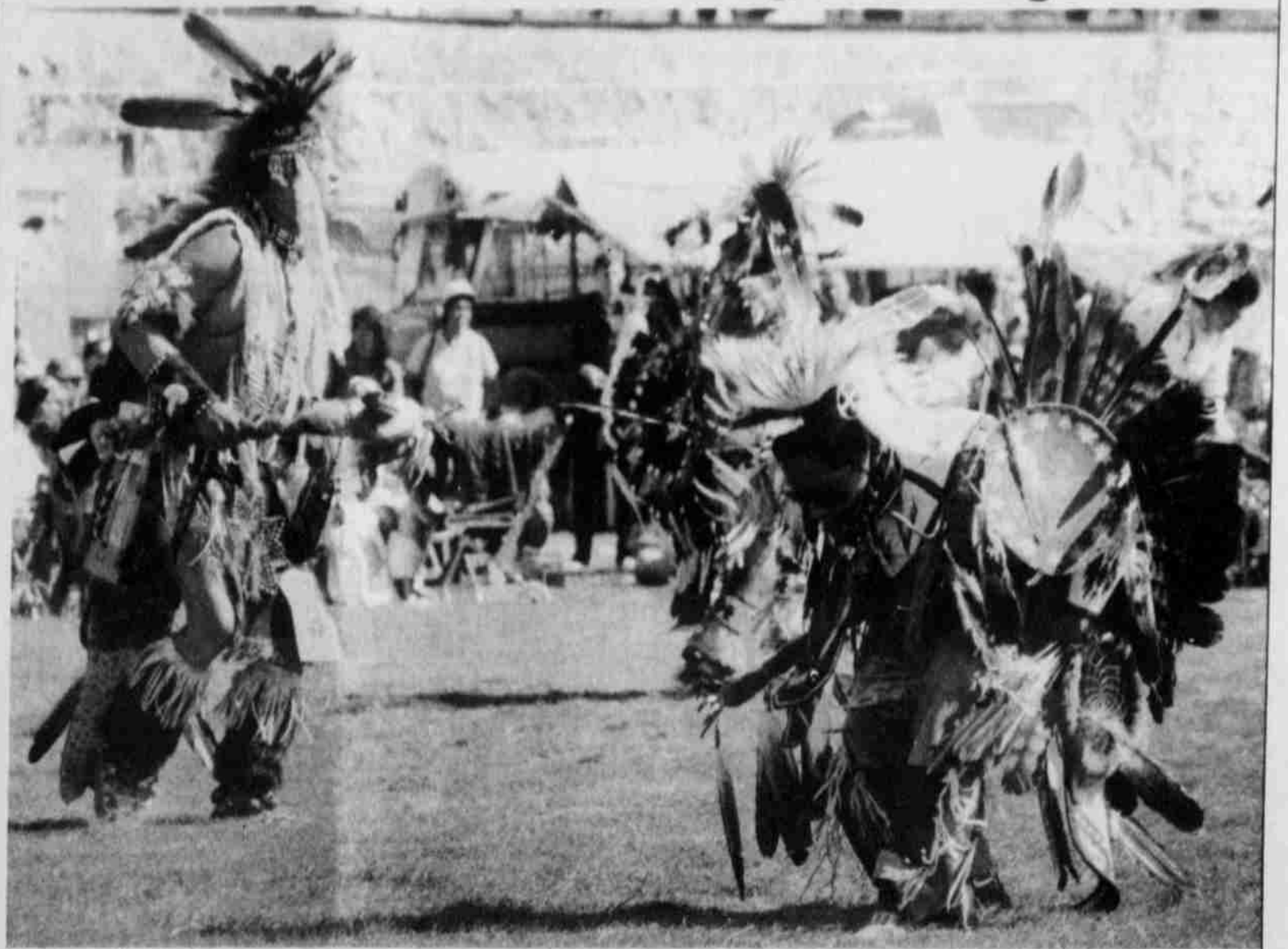
Dancers exhibited their expertise during the Pi-Ume-Sha powwow. Attendance was down bit from last year, but that didn't seem to dull the spirit of the weekend.