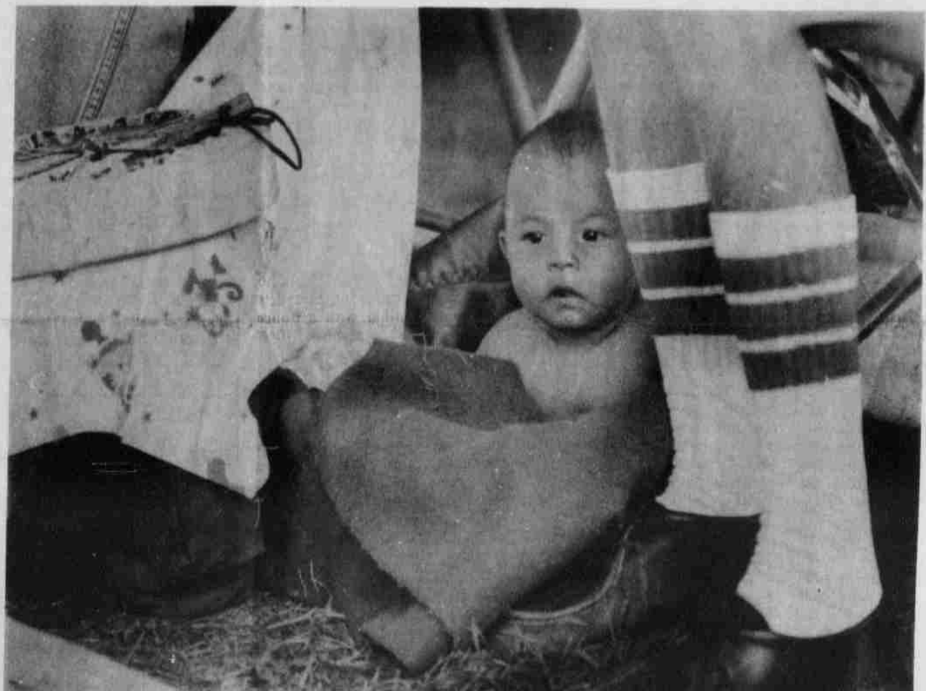
A young spectator kept an eye out on the stickgame tournament. The baby was completely satisfied with the tournament action and didn't fuss a bit.