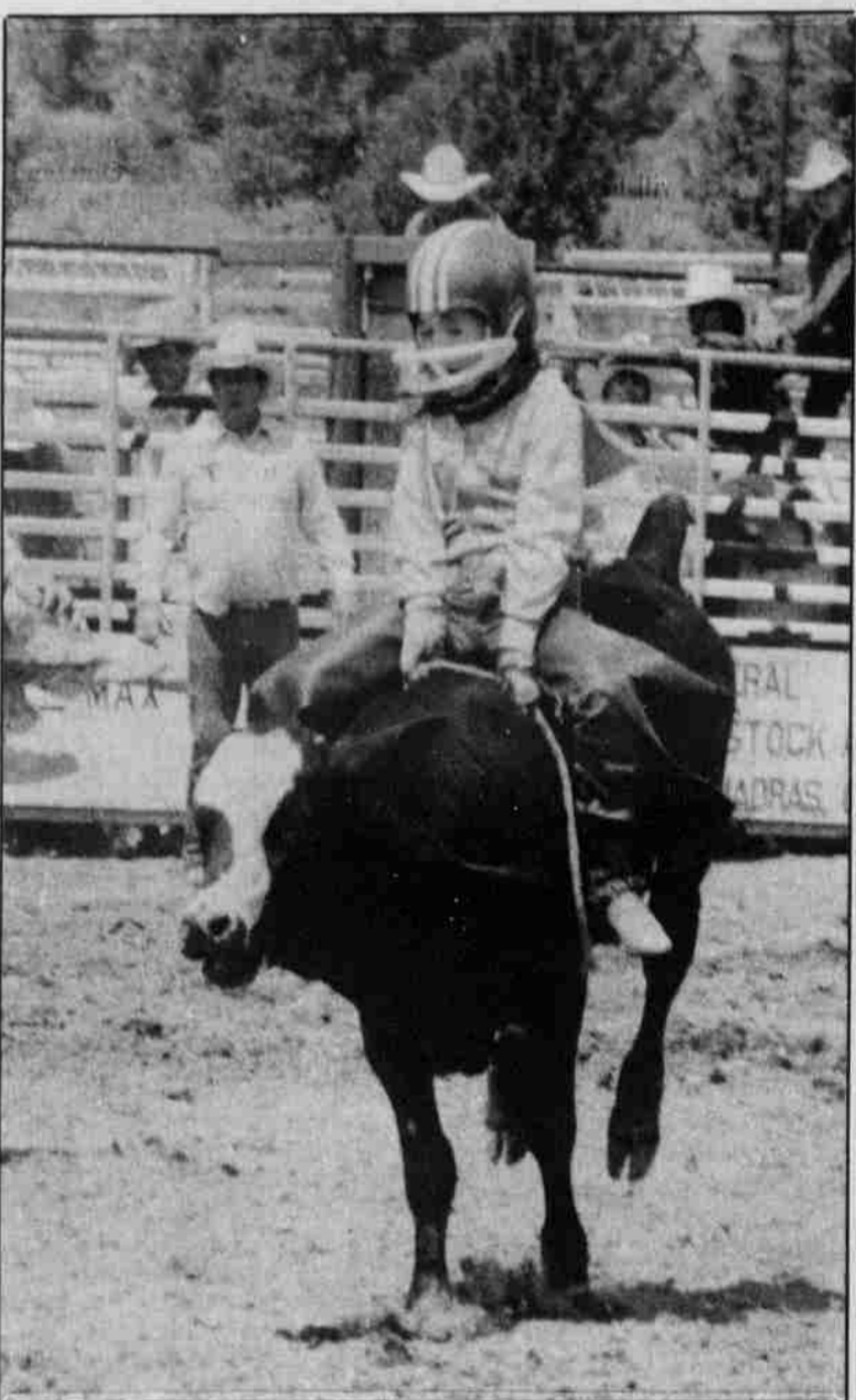
Counting the seconds. . .

Rodeo admission, adults $4.00, children under 12 $2.00, senior citizens free. A buckaroo breakfast Sunday morning June 28, at 7 a.m. at the rodeo arena $3.50 per plate, sponsored by the Warm Springs Rodeo Association. Plenty of concessions on the grounds, the Rodeo Committee not responsible for theft or damages.