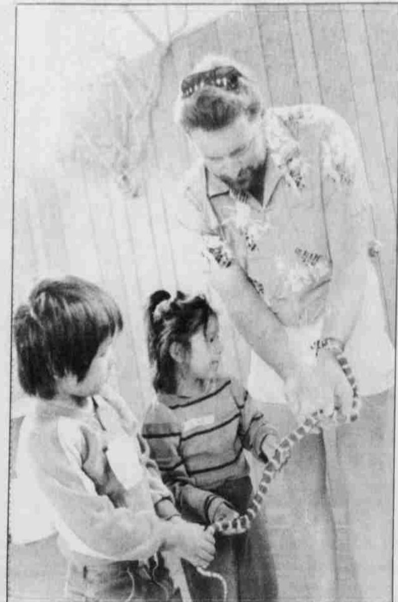
A presentation by the Oregon Museum of Science and Industry May 14 acquainted Warm Springs Elementary students with a variety of snakes.