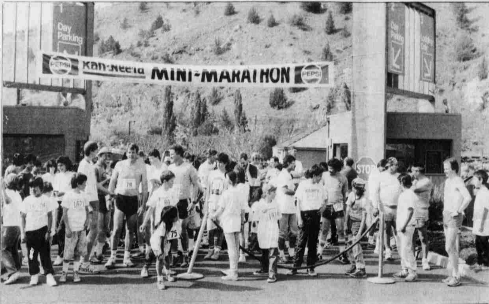
Runners of all shapes, sizes and ages converged on Kah-Nee-Ta Village to partake in the annual Kah-Nee-Ta Mini-Marathon. The weather, with moderate temperatures, made for perfect running conditions. Entrants were given swim passes to the Village pool to cool off after the run.