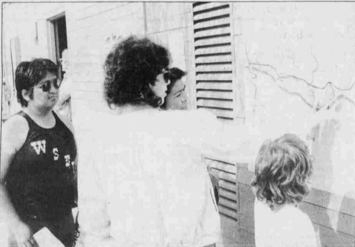
Runners checked the three and six mile course map before the beginning of the race. The course had participants running on highway 8 along the Warm Springs River and through Kah-Nee-Ta Golf Course.

There was a total of 158 runners who covered the 14.5, the 10 K and the three mile runs on a hot Saturday, April 25, 1987.