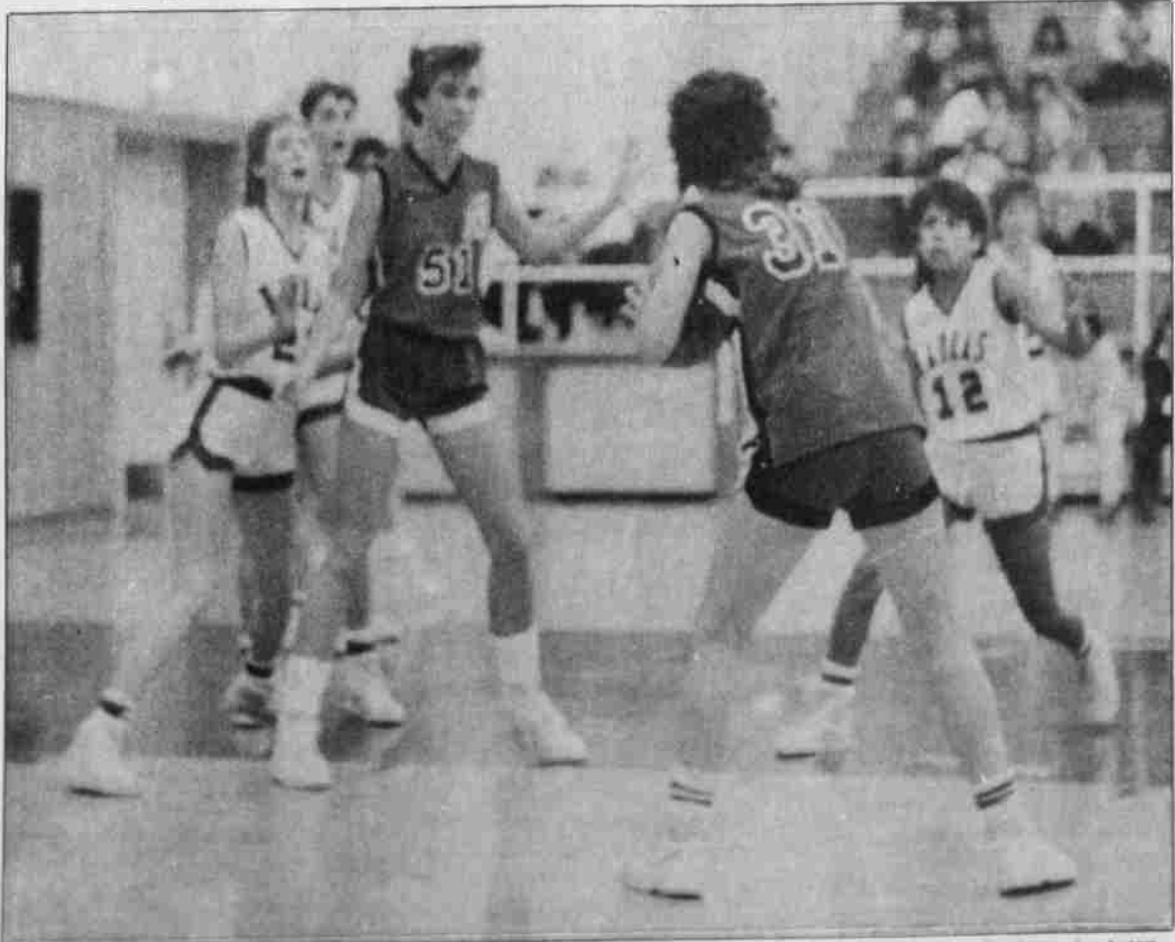
Buff gals putting up a tough defense against the McLaughlin High Pioneer girls. Madras went on to win the game in GOL league action.

The Madras White Buff gals ran into a bit of trouble in the first and the final quarter being out scored 11-6, and 19-11 respectively giving the Bend team a good edge for the game.