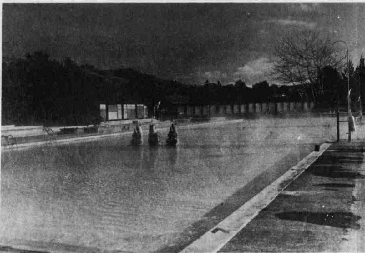
Kah-Nee-Ta Village swimming pool is now open from 9 a.m. to 9 p.m. daily. The River Room is open for business from 8 a.m. to 8 p.m.

Lola Sohappay Judge, Warm Springs Tribal Court