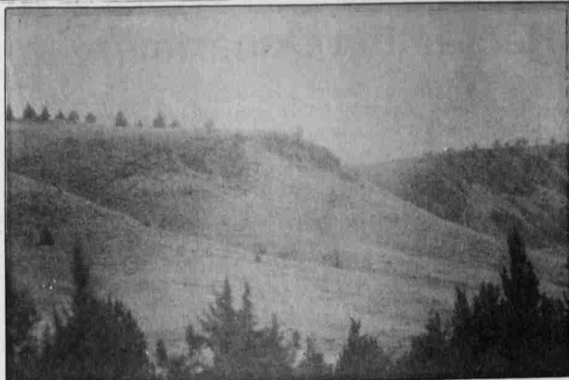
Jim Macy was the winner of our last Geo Quiz by guessing its exact location as being just as you drop into Dry Hollow on Jackson Trail road at mile post 6. Here is another photo for someone to guess its exact location and win a years subscription to the Spilyay Tymoo, call 553-1644, with your answer.

If the holiday season left you with candle wax on your carpet, you can remove it by scraping off as much as possible then put a brown paper bag over the wax and run a hot iron over the bag. This acts as a blotter and absorbs the wax!!