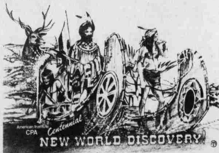
One float at this year's Tournament of Roses Parade will feature the theme, "New World Discovery."

The AICPA got its start only two years before the 98-year-old Tournament of Roses Parade. A century ago, seven men were called to-