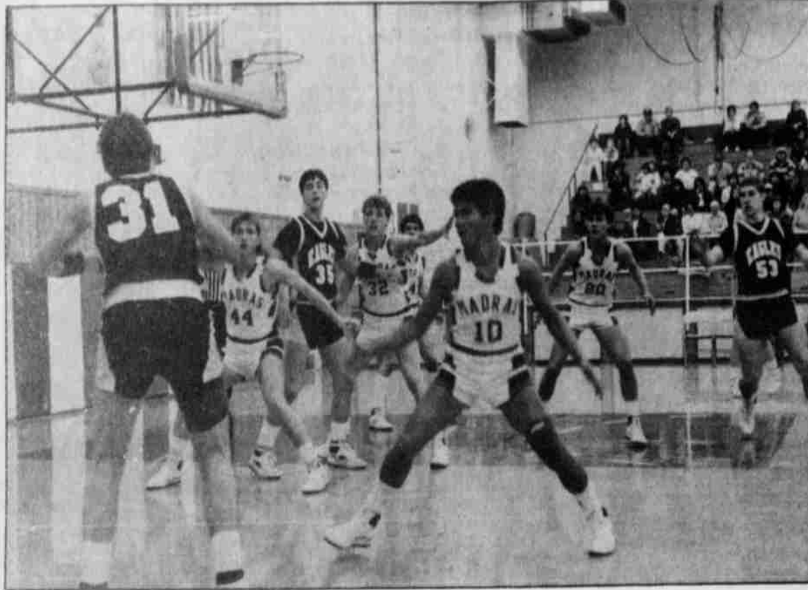
During the boys basketball game between the Madras White Buffaloes and the Hood River Eagles, the Buffs put up a good defense and went on to win the game and the championship.

The 28th annual men's Holiday basketball tournament gets underway December 31, 1986 and will run through January 3, 1987.