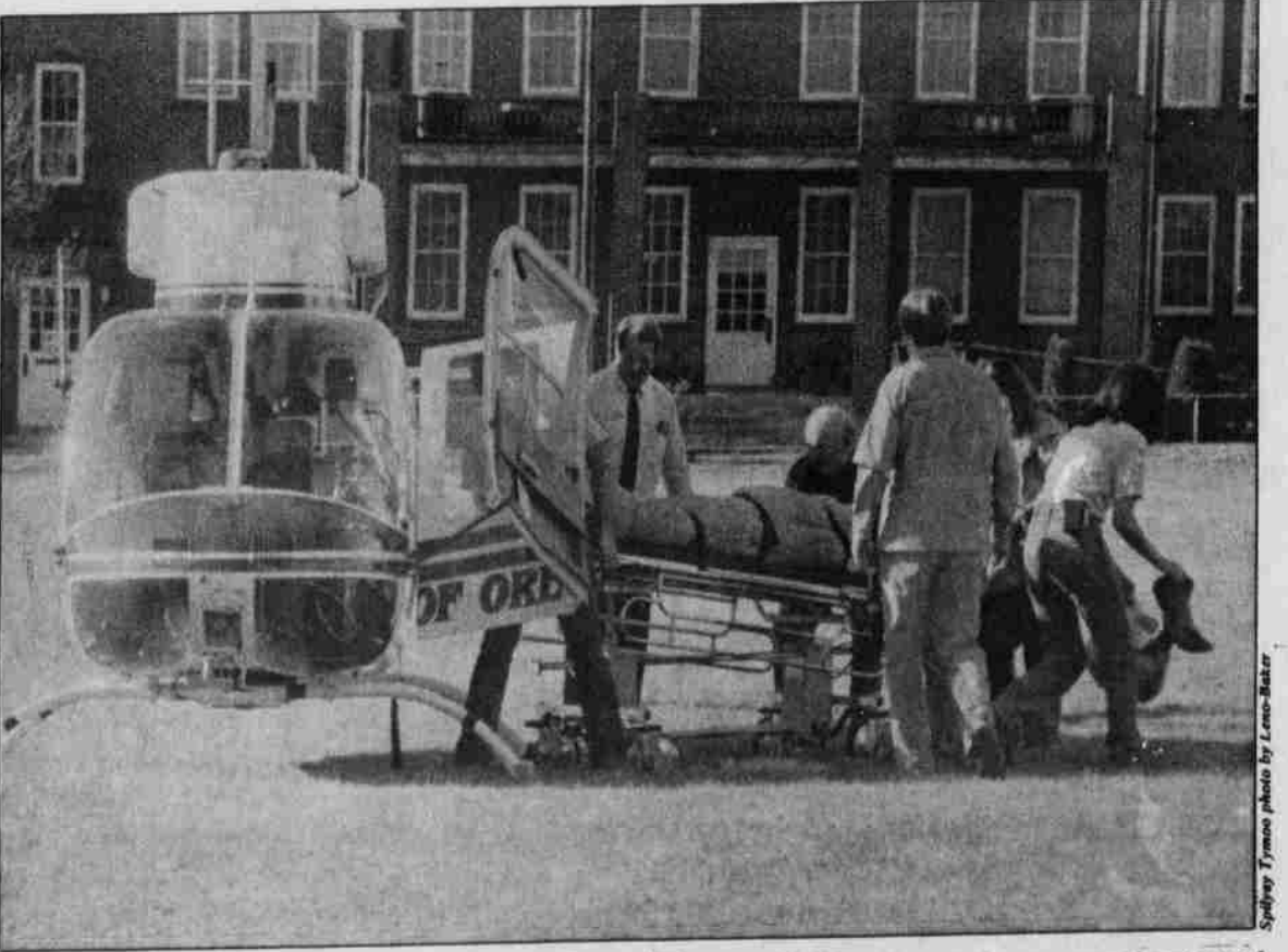
Spilyay Tymoo photo by Leno-Baker

"Many of these social changes could lead to lowered self-esteem," the article states, "reducing coping skills and (leading to) loss of hope."