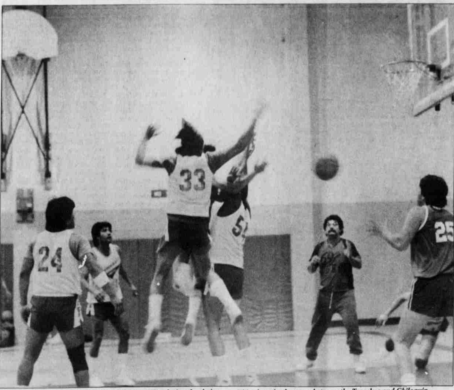
With arms tangled, a foul called during heavy action during the elmination tourney the action was wild and some pretty close games played.