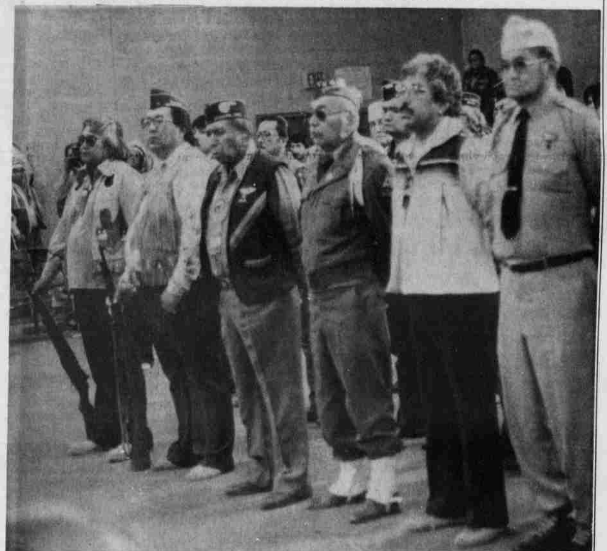
Honor guard at Yakima