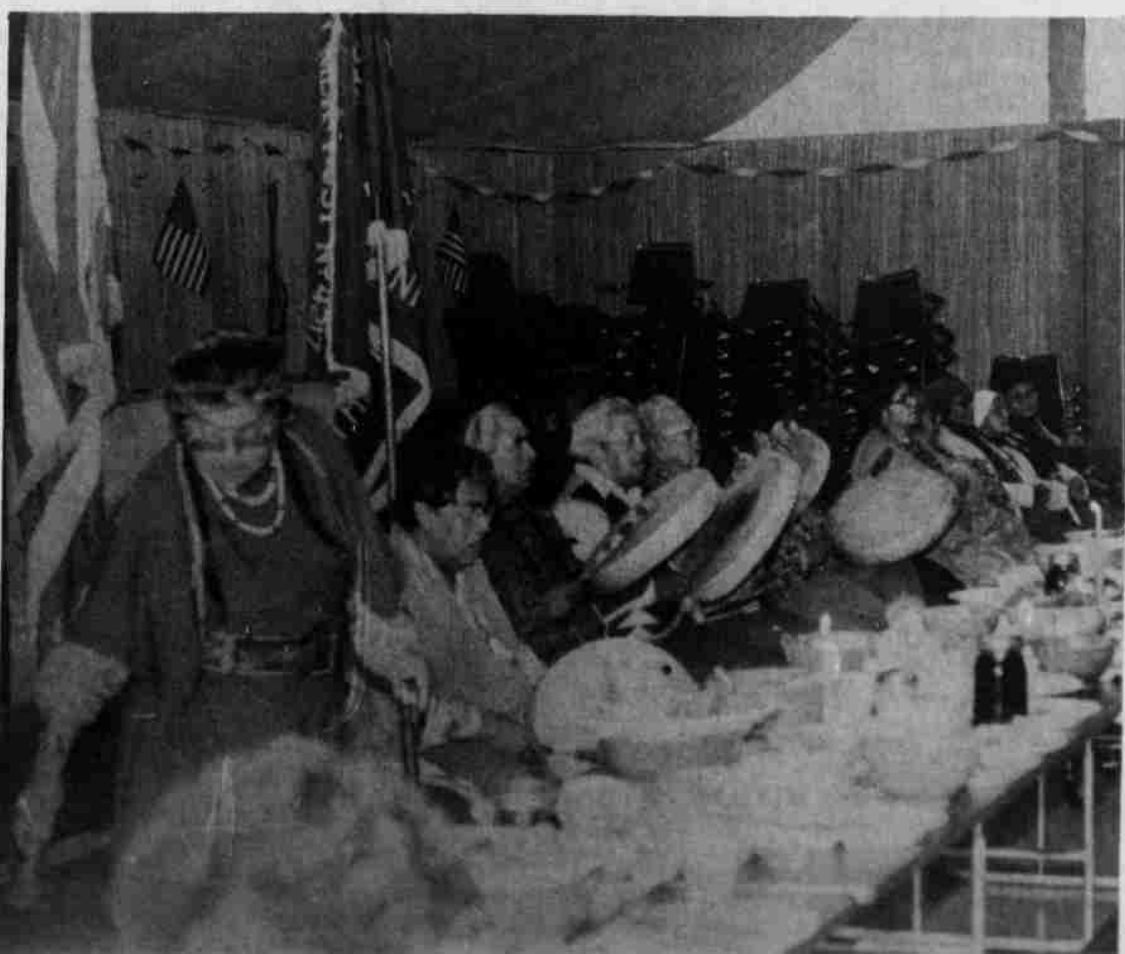
Seven Drum ceremony before Veteran's dinner