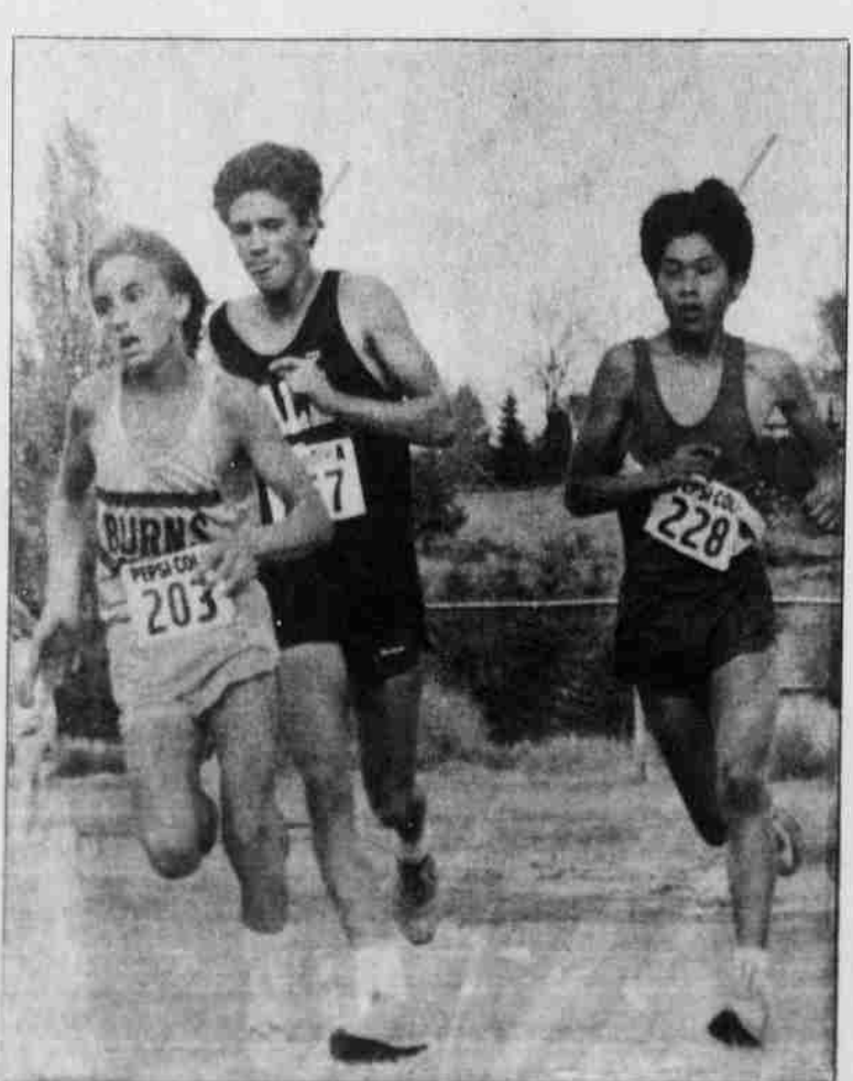
Modes High box's cross country track team finished first at the The sect held at Madras October 25. Other teams competing were