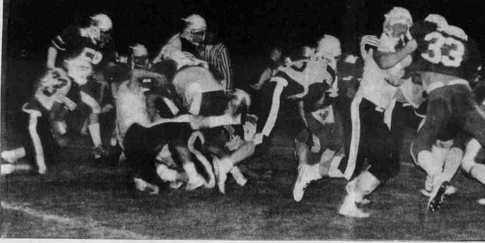
The action was wild and furious in the game between the Vale Vikings and the White Buffaloes. The Buffs won the homecoming game, 21-0.

The Buff Boosters meetings are regularly held the first Thursday of each month. The month of November will be an exception. This month's meeting will be held on November 13, 1986 in room 1 at Madras High School at 7:30 p.m. December's meeting will be regularly scheduled for December 4, 1986 in Warm