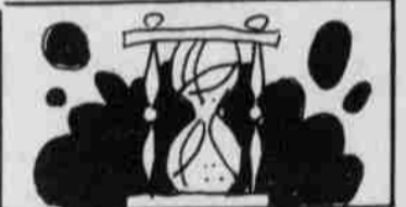
A day is not really 24 hours long. It's exactly 23 hours, 56 minutes and 4.1 seconds.

If you would like to review other rules for commas or have other questions about grammar, stop by at the Adult Learning Center. The Center offers classes and individualized instruction in English, math and reading. The Center also helps people prepare for their GED or work towards a high school diploma. Call the Center at 553-1428 for more information.