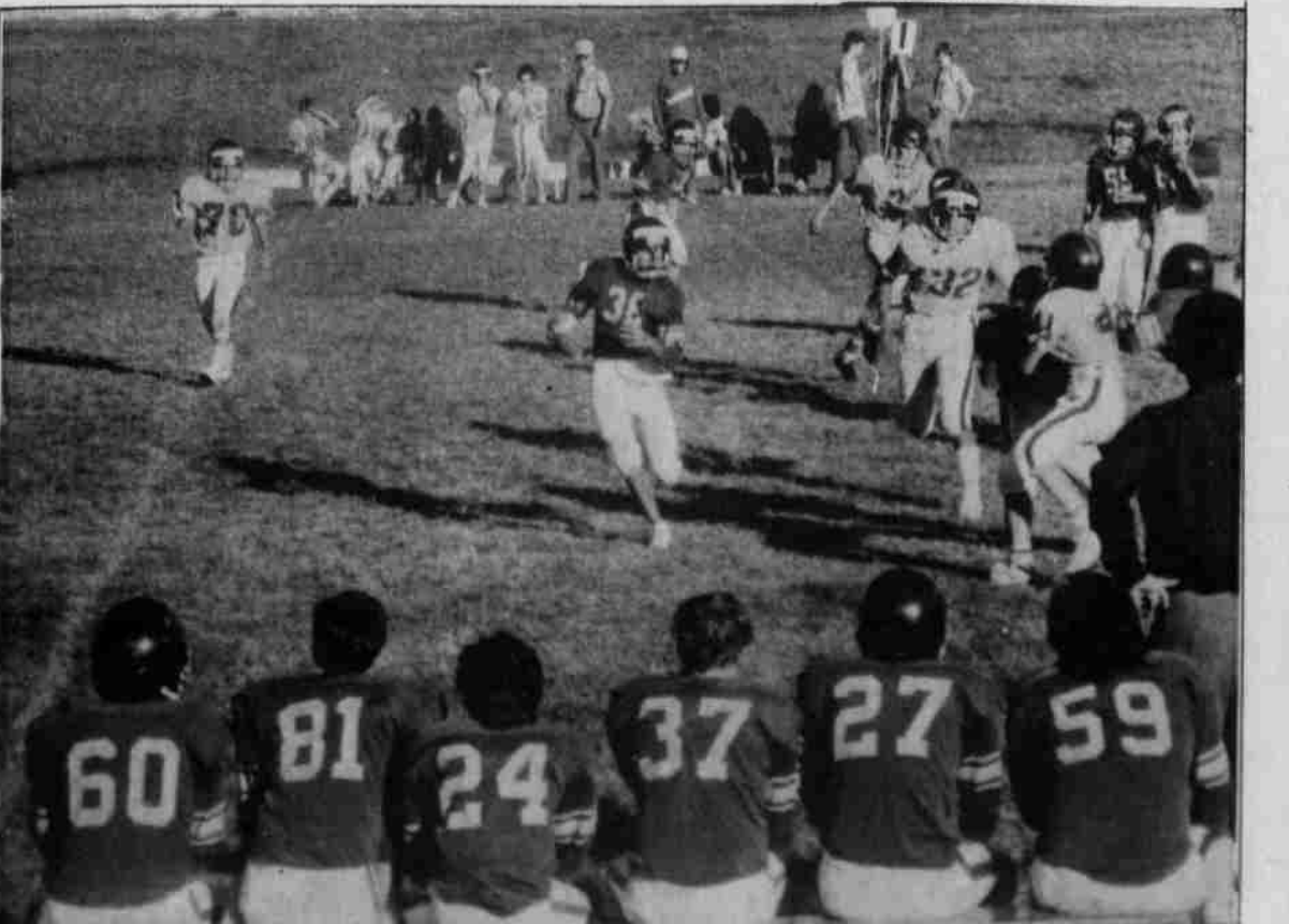
Eighth grade football players finish their season Monday with a game against Culver.

We have enjoyed your support of our athletic programs this fall and look forward to seeing you for wrestling and basketball.