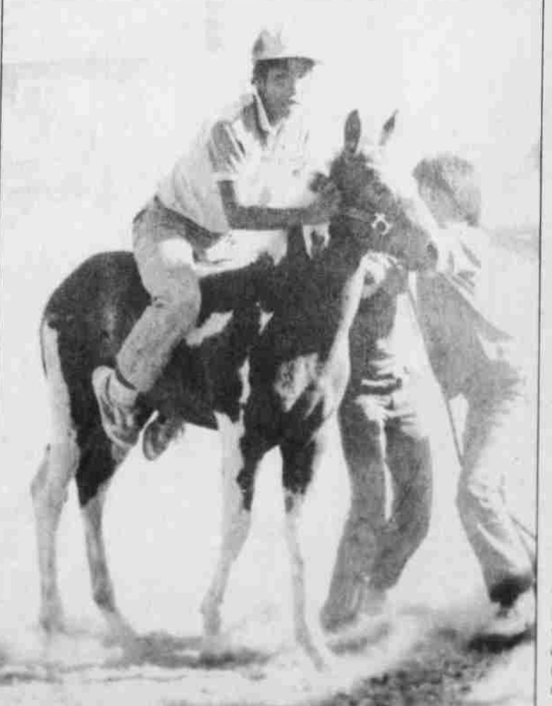
Three unidentified boys participating in the Wild Colt Race, held during Huckleberry Feast weekend at He He

A lot of kids start their riding experience here, getting the taste of rodeo, riding calves and cows. Just a great time!