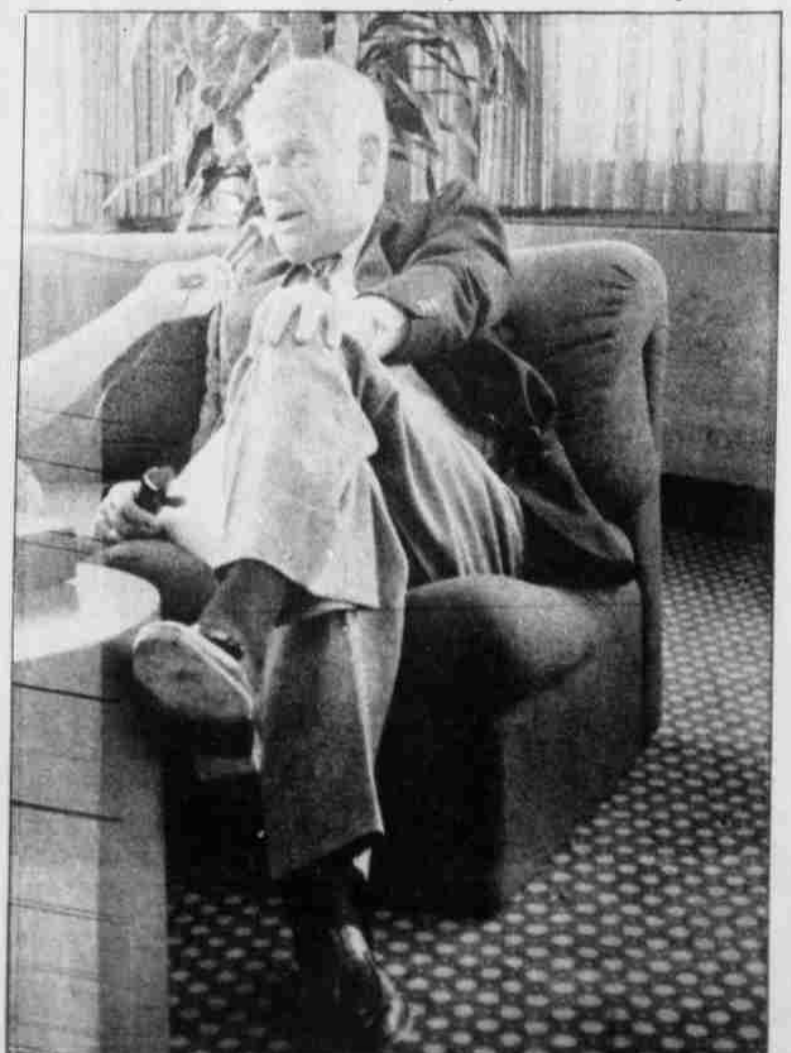
During a visit to Kah-Nee-Ta June 30 republican senator Mark Hatfield made himself available to Radio KWSI and to area residents to answer questions on educational issues and other subjects.