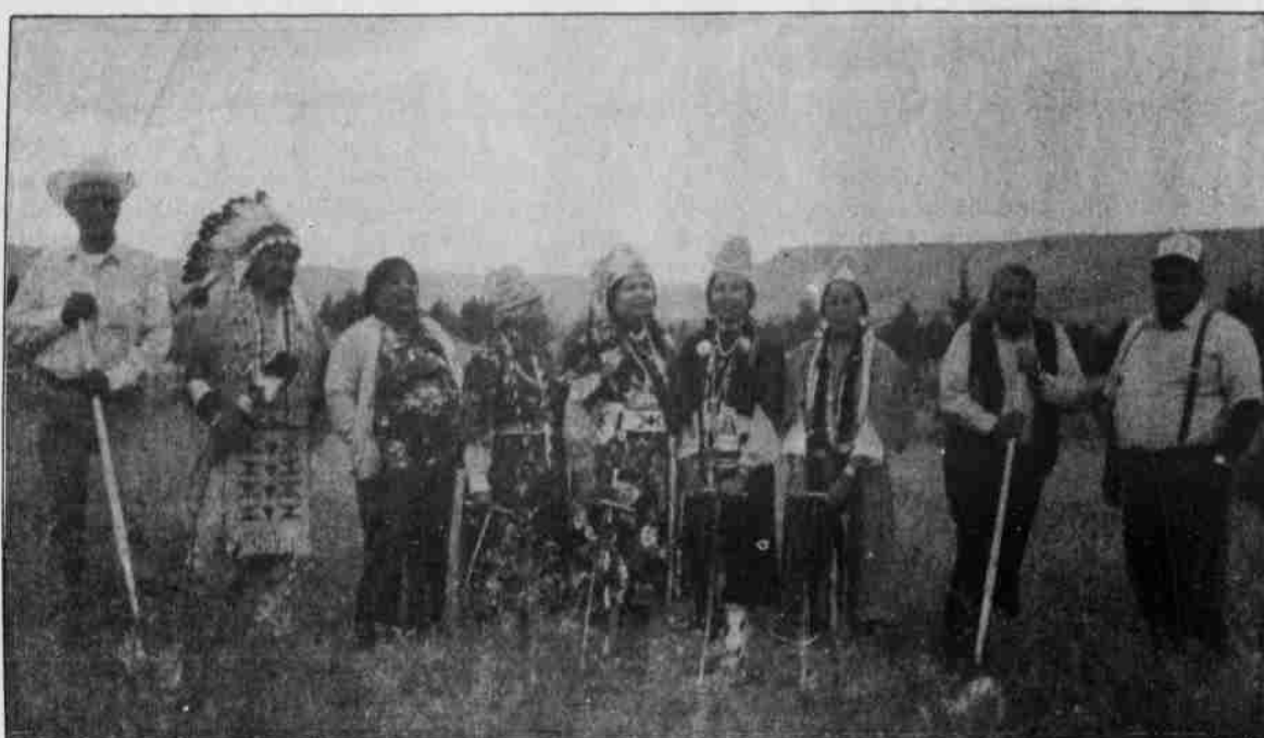
Let the project start. . .

The NAPA Board of Directors meet quarterly so on the drawing board will be the next annual conference and other upcoming events by the Native American Press Association.