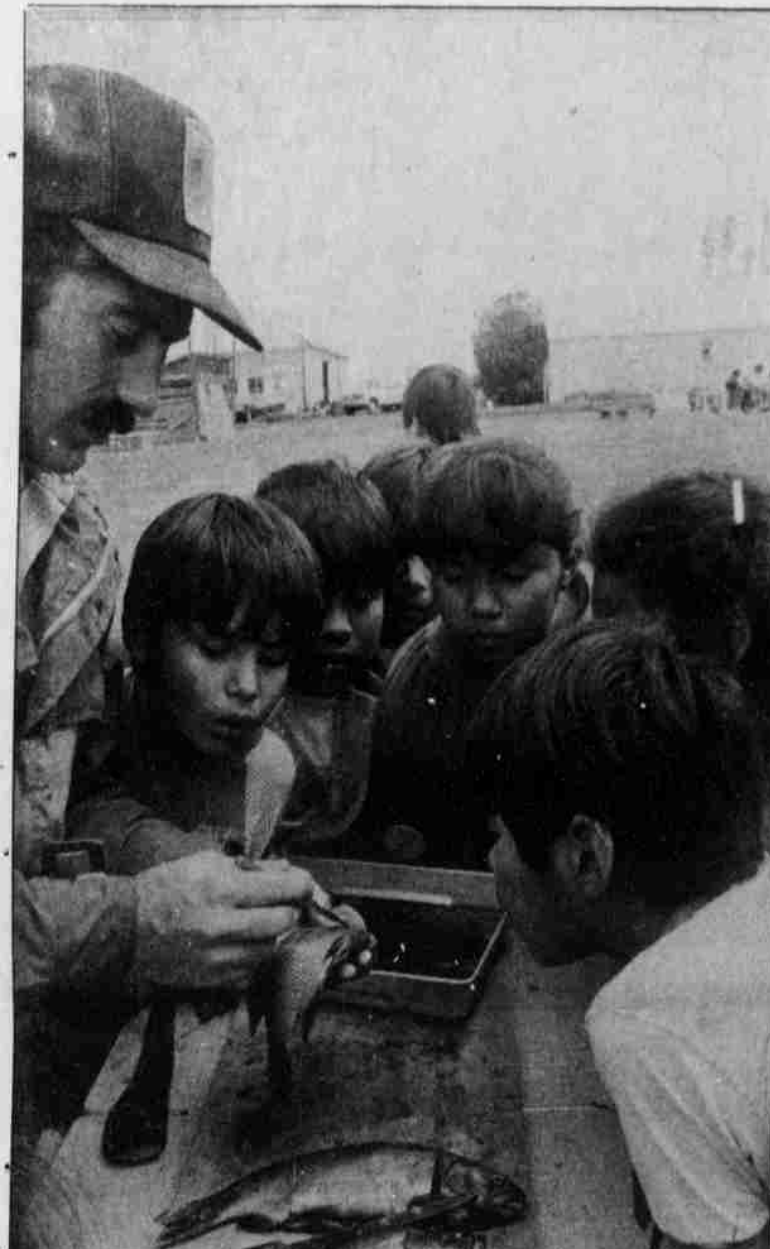
Learning about fish

Bible Study: Wednesdays, 7 p.m. Telephone: 553-1237