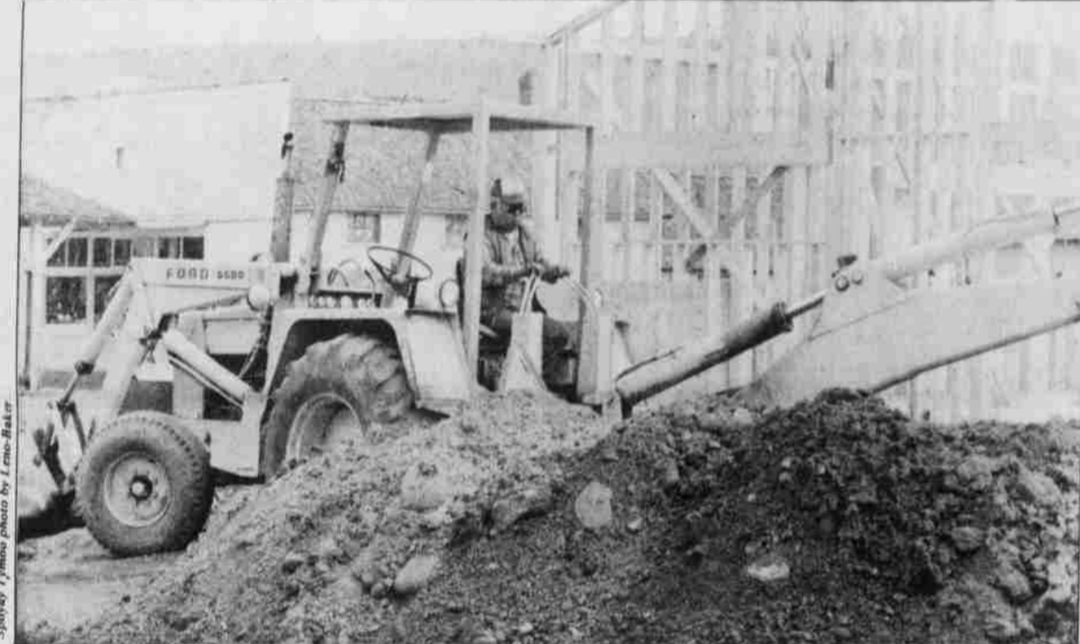
WORK PROGRESSES—The work on the Warm Springs Post Office is now in progress and within five months the building should be completed and in use according to building contractor, C. Jeffer. Crews are working from dawn to dusk and are ahead of schedule. Jeffer stated he has been using sub contractors for some of the work. Pictured above is Leroy Scott who sub-contracted to do backhoe work. Bids are being accepted for the landscaping.