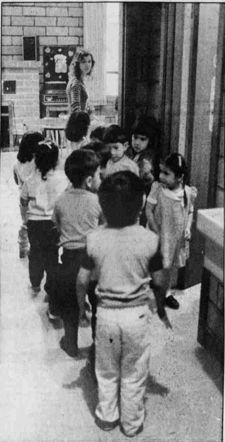
Handwashing and toothbrushing are important hygiene habits learned at pre-school.