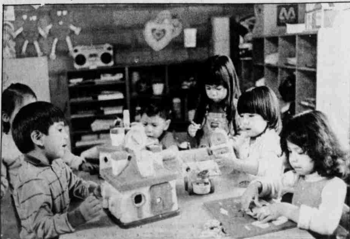
Children assembled and disassembled puzzles in the activity center.