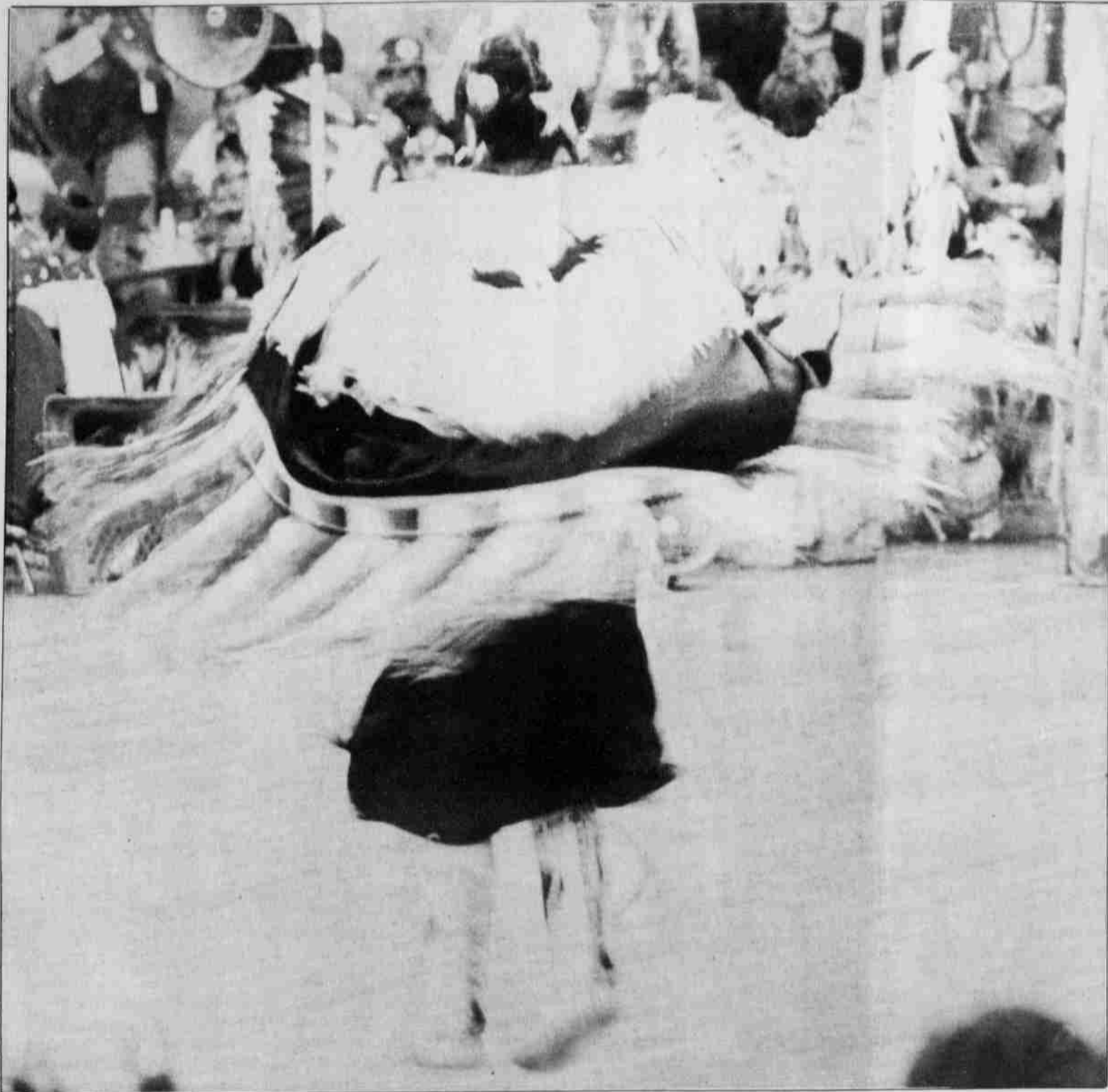
The graceful Shawl dance