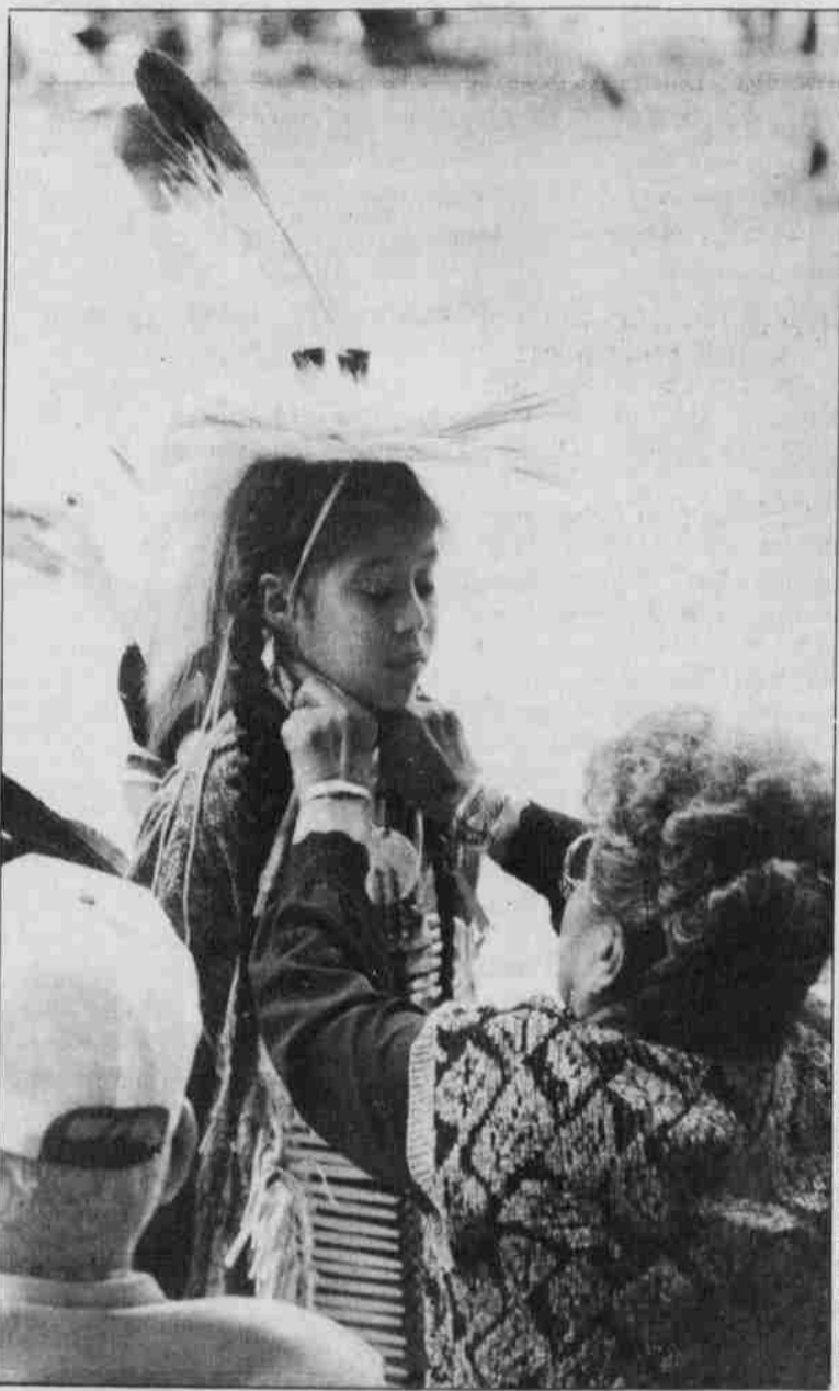
Preparation for contest dancing