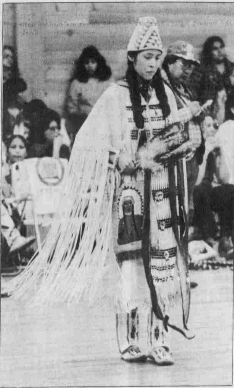
The rhythm of Traditional Dancing