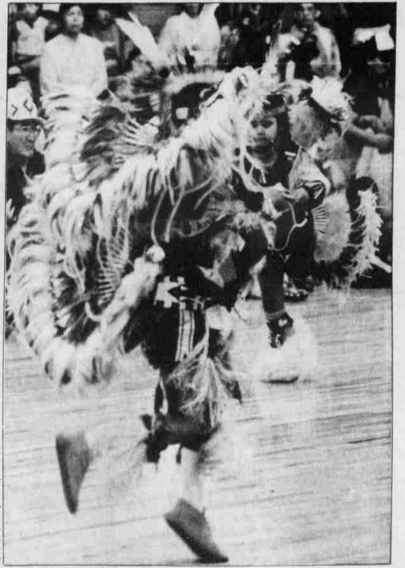
Colorful regalia of fancy dancer

Neither rain, nor snow, nor sleet, nor dead of winter kept contestants and spectators from enjoying the eleventh annual Lincoln's Birthday Powwow held in the Simnasho Longhouse February 14, 15 and 16. Snow-packed roads, travelers' warnings and low temperatures for the Warm Springs area did not hamper many people from attending the powwow. Three hundred dancers took part in the contests with 15 drumming groups taking part in the drummers' contest.