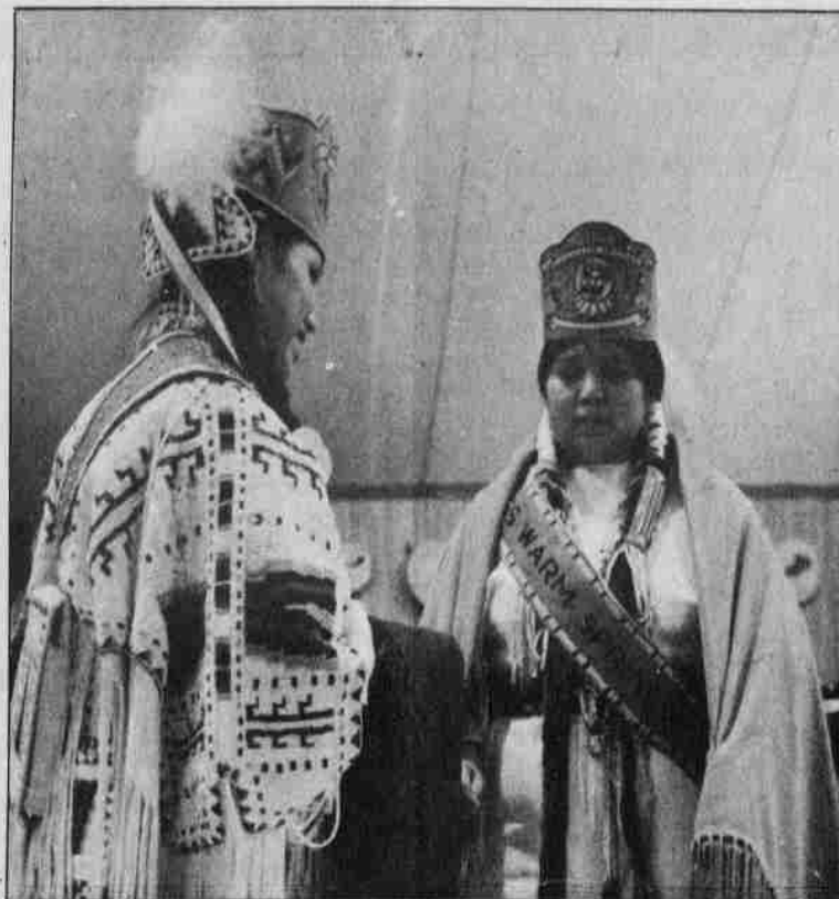
More royalty ...