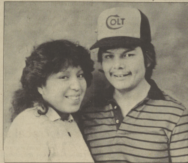
Spilyay Tymoo photo by Behrend