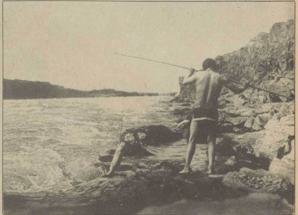
Indian fisherman is pictured gaffing salmon on the Columbia River. Edward Curtis photograph was taken 1909.

You've always dreamed of owning a baseball cap sporting a screen printed Spilyay Tymoo emblem, right? Well, here's your chance! For a mere $6.00 you can be the owner of just such a cap. Contact the Spilyay office or catch us at the Christmas Bazaar December 14.