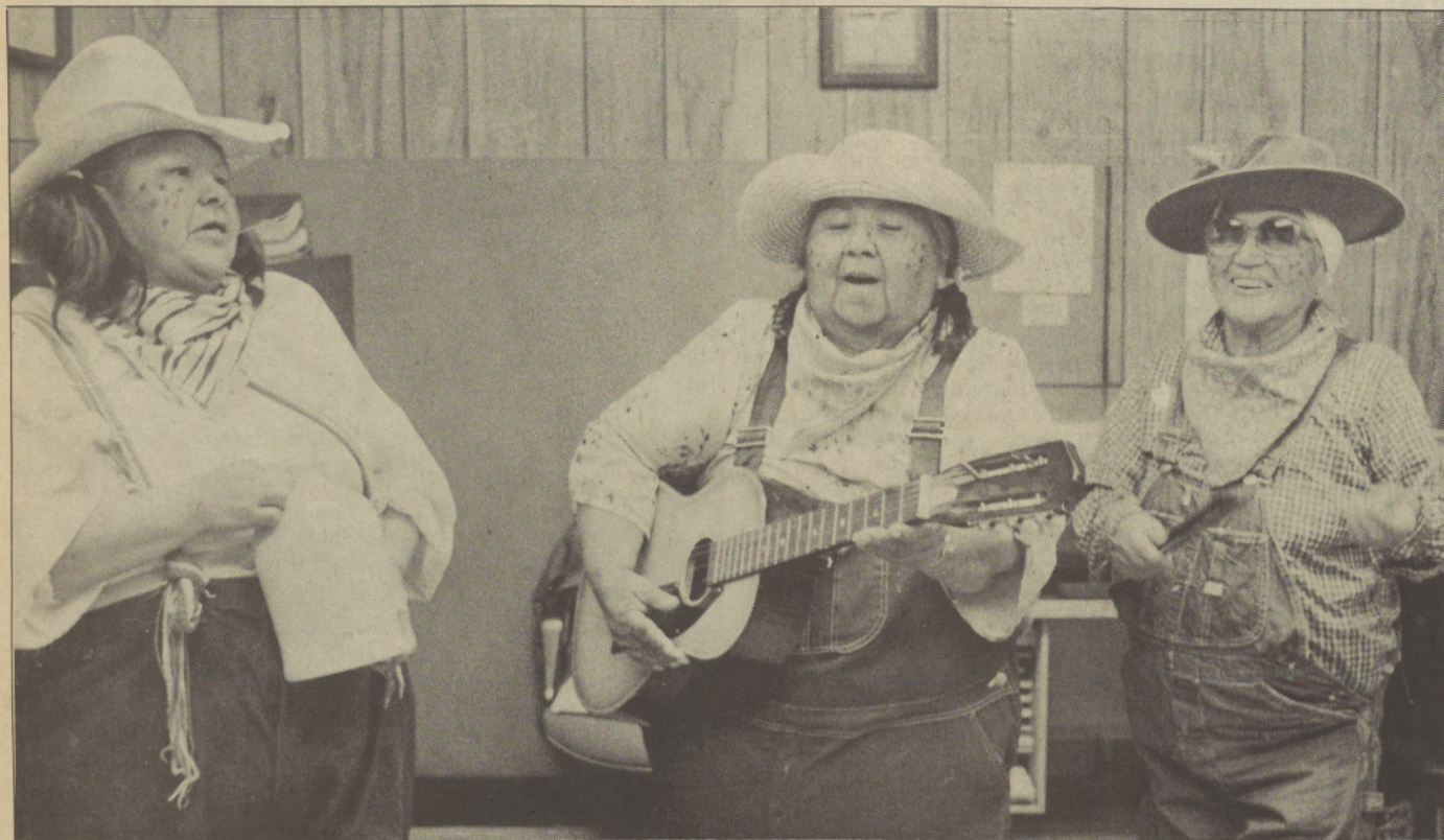
Spilyay Tymoo photo by Shewczyk