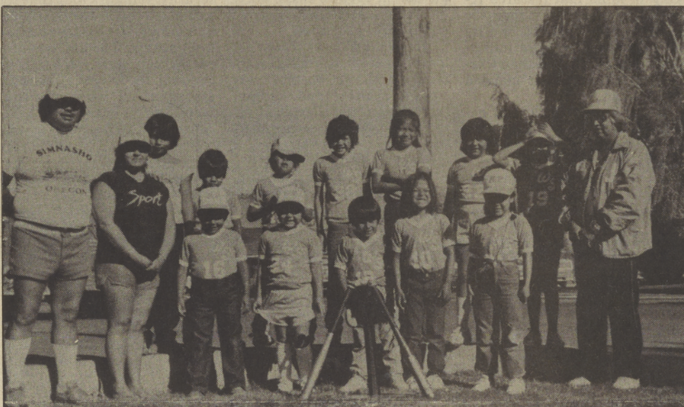
The Rat Pack

In the Jefferson County T-Ball league there are seven teams which consist of the Rat Pack, Warm Springs Fire and Safety, Warm Springs Stingers, Madras Reds, Madras Sprouts, Culver Orange and Culver Blue. The league began May 28 and