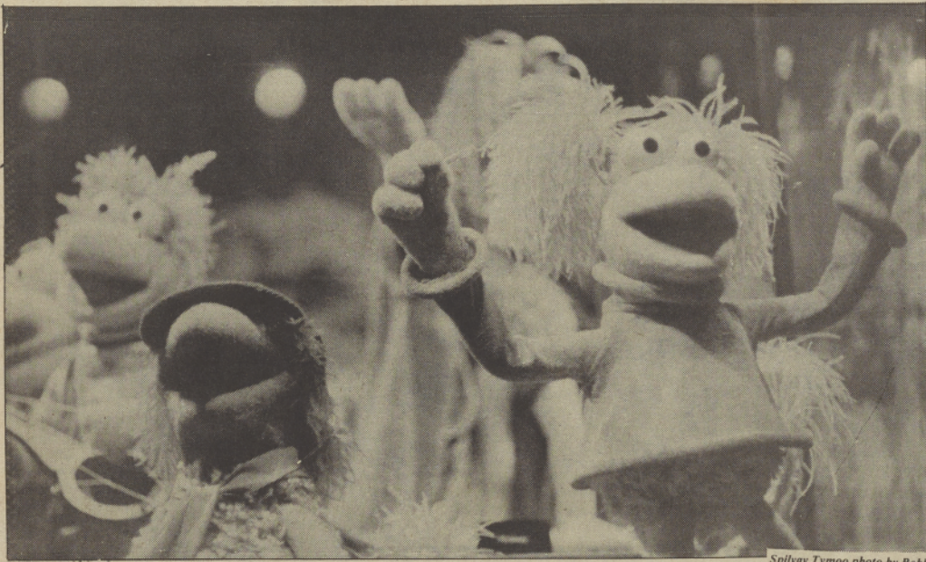
The Frivolous Fraggles entertain both children and adults with their humor and antics. Muppets are on display through August 15 at Oregon Museum of Science and Industry.