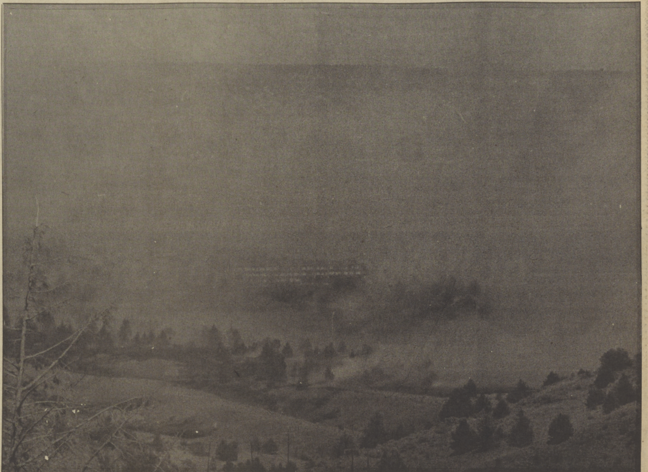
SURROUNDED —The Kah-Nee-Ta Lodge was totally surrounded by fire during the June 23 blaze that blackened 960 acres and seriously burned five men.

There have already been a number of fires in the Warm Springs area. It is important that the public be aware that the fire danger is higher than normal for the area. For tips on how to prevent fires at your home contact Fire and Safety at 553-1161, ext. 200.