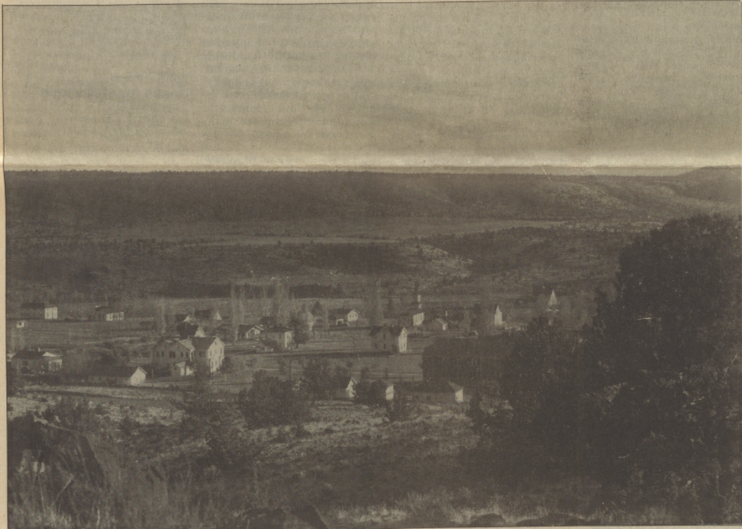
How our town has changed