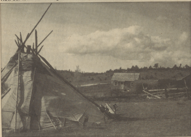
A look at the old and the new