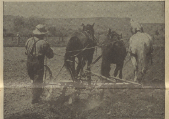
Farmer in Tenino