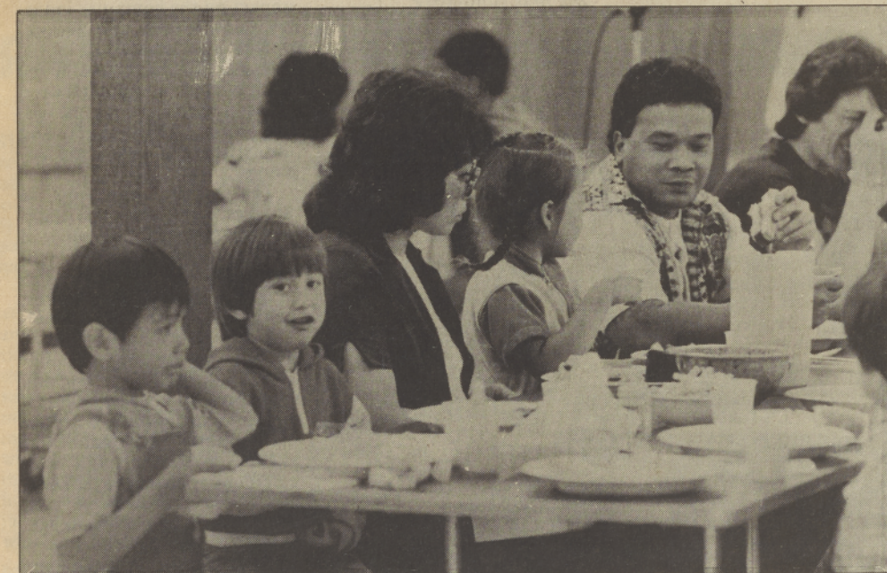
The end of the headstart school year was marked for students and their parents with a powwow held at the Community Center followed by a dinner at the Agency Longhouse. Parents received scrapbooks filled with pictures of their child and the many activities held during the school year.

For further information contact Fire Management Office, 553-1121, ext. 413 or 553-1146.