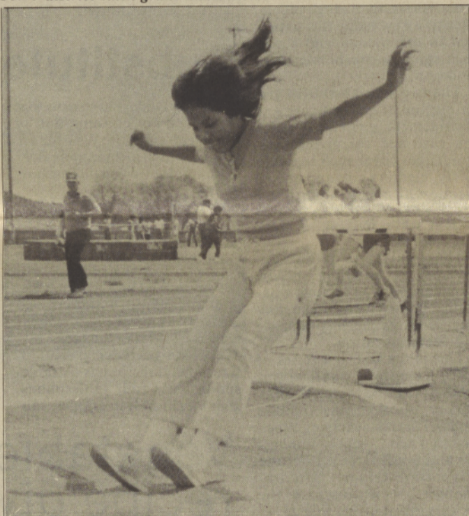
The long jump was another track and field event in which students could test their skill.