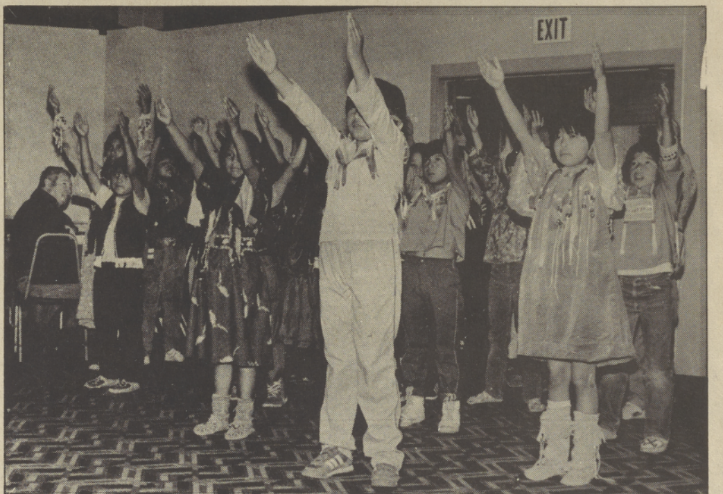
Luncheon prayer Warm Springs Elementary fourth grade students and former Simnasho students performed the Lord's Prayer during luncheon at the 10th Annual Oregon Indian Education Conference held April 10-12 at Kah-Nee-Ta Resort.

Deeply concerned over the sharp increase in serious injuries and fatalities with 3-wheel, all-terrain vehicles (ATVs)—The U.S. Consumer Product Safety Commission (CPSC) today unanimously approved a seven-step plan of action. In the past three years there have been more than 100 deaths and over 100,000 injuries related to ATVs. Over 750,000 ATVs are expected to be sold in the United States this year, a figure likely to increase in the years to come. The Commission announced that it will publish and Advanced Notice of Proposed Rulemak- ing, the first in several years. The other six steps of the action plan include: 1. Conduct a hazard analysis to obtain detailed information on ATV use. 2. Undertake an engineering, human factors and medical analysis of ATVs and their use. 3. Hold a series of public hearings in five locations around the U.S. to solicit user and consumer input. 4. Monitor the development of voluntary standards of ATVs, pending review of future date and industry activity. Continued on page 3