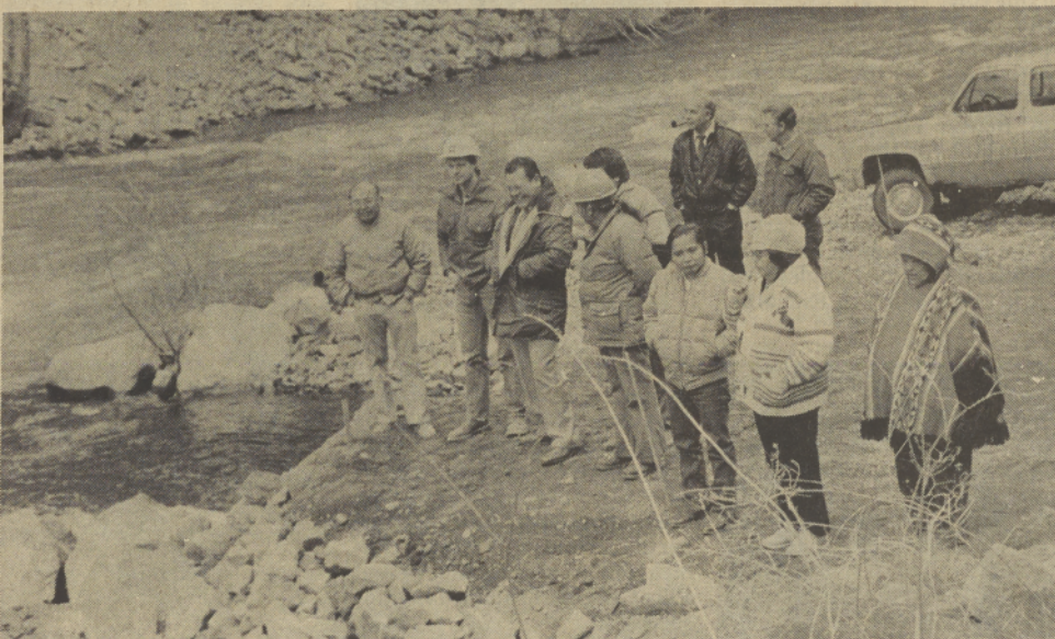
Tour of hydroelectric project